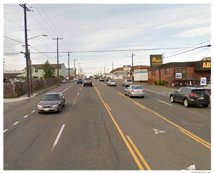
Looking north on Aurora Ave N (SR 99), near the intersection of N 92nd St