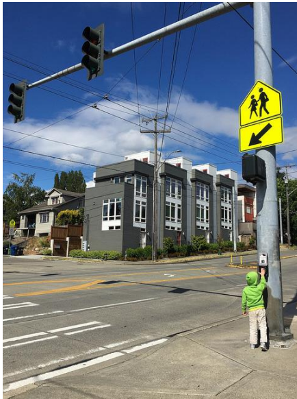
Example pole and mast arm signal