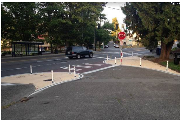
Example of painted curb bulbs