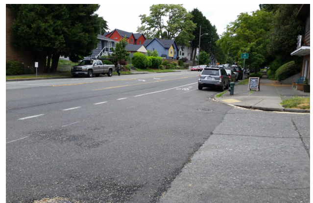
Looking north from the SE corner of SW Raymond St and Fauntleroy Way SW