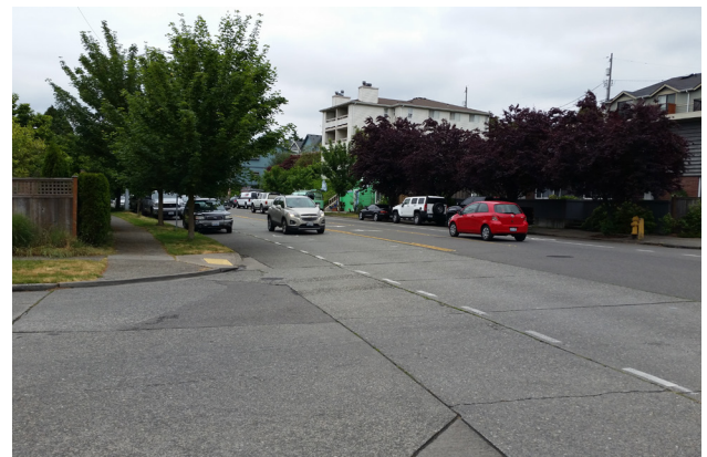
Looking north from the SW corner of SW Graham St and Fauntleroy Way SW