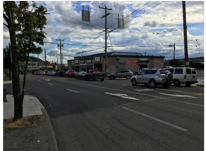
12th Avenue S and S Main Street: Looking south