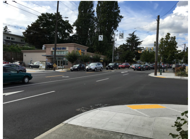
12th Avenue S and S Main Street: Looking north

No improvements for this location are proposed as part of the NSF program.