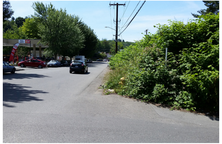
Looking west from the northeast corner of 35th Ave S and S Charlestown St

If additional money is available, we also request the city provide safety crossings of Rainier Ave S at South Charlestown Street for the people who walk to and from the busy Metro stop at this corner. People who drive at this corner often speed, and make fast turns without paying enough attention to people (many who are other-abled or seniors) who are crossing Rainier Avenue S to get to and from the bus.