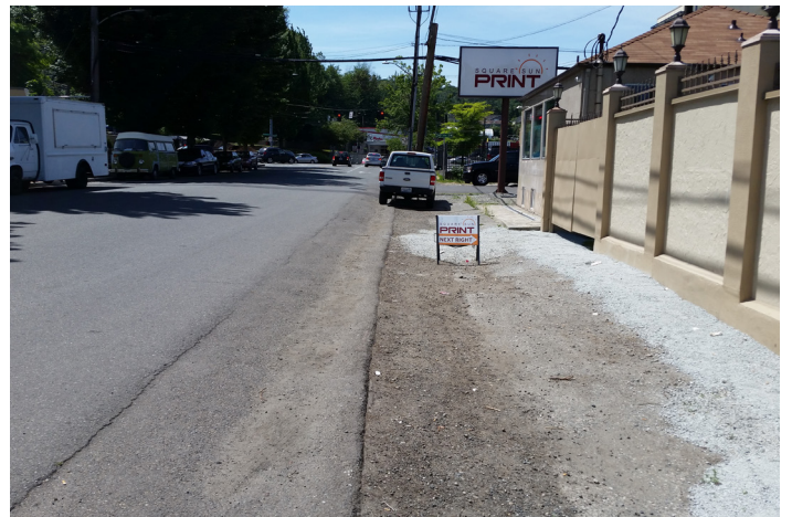
Looking west from the north side of S Charlestown St east of 34th Ave S