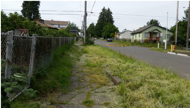
Looking north from the west side of 39th Ave S south of S Juneau St

Please repair cracked pavements, install proper curbs, and fix drainage issues.