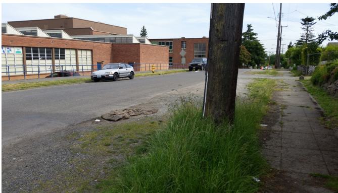
Looking southeast near 6113 39th Ave S from the west side of the street