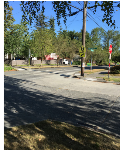
Intersection of E McGraw St & 19th Ave E