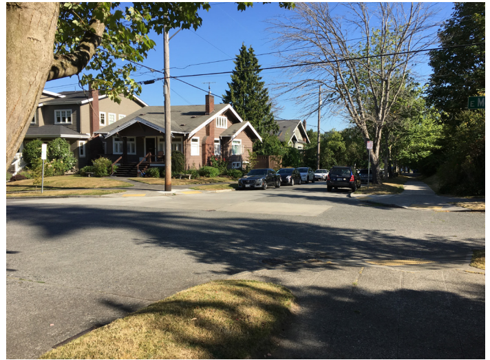
Intersection of E McGraw St & 20th Ave E

No improvements for these locations are proposed as part of the NSF program.