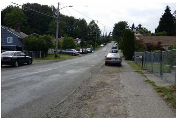
Looking west from the NW corner of S Dawson St and 32nd Ave S