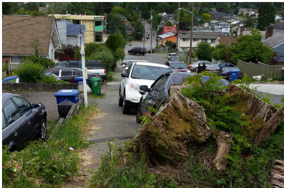
Looking east from the NW corner of S Dawson St and 31st Ave S