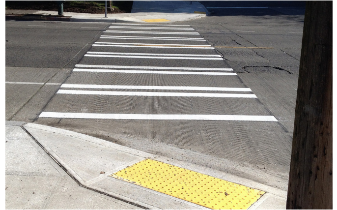
New and upgraded curb ramps at many intersections along N 50th St.