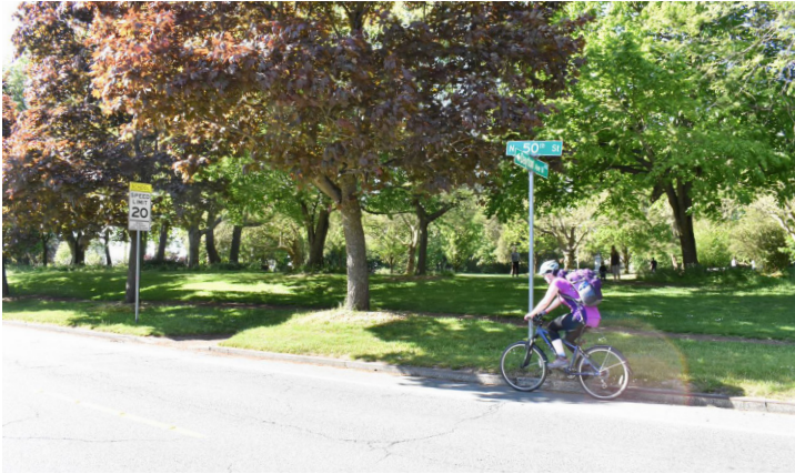
N 50th St will soon have wider bike lanes!