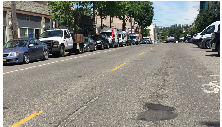
University Way NE is ready for repaving.

Approved by voters in 2015, the 9-year, $930 million Levy to Move Seattle provides funding to improve safety for all travelers, maintain our streets and bridges, and invest in reliable, affordable travel options for a growing city.