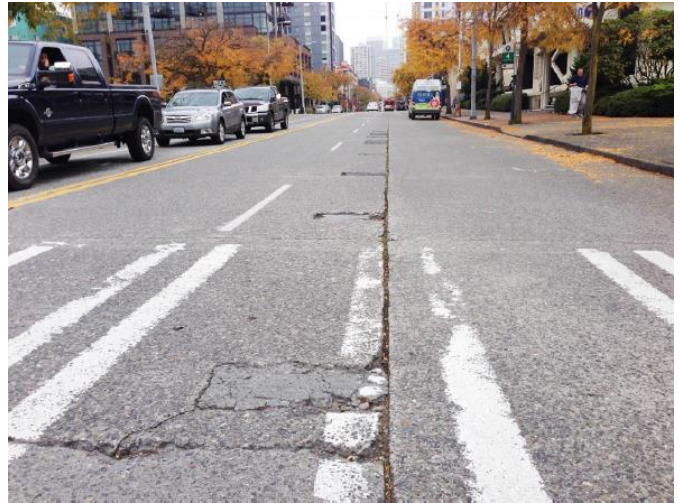
Wear and tear on 3rd Ave before repaving

This project is funded by the 9-year Levy to Move Seattle, approved by voters in 2015. Learn more about the levy at www.seattle.gov/LevytoMoveSeattle.htm