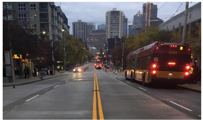
Durable, smooth concrete panels on 3rd Ave after repaving