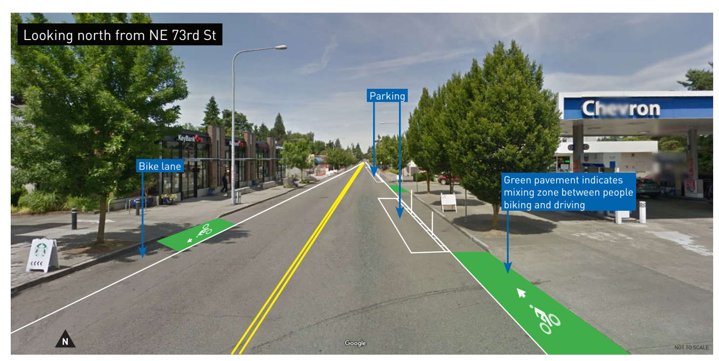
Parking consolidated to east side of street; 4-6 PM parking restrictions removed