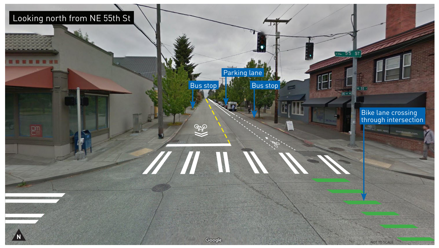
Parking consolidated to east side of street; 4-6 PM parking restrictions removed