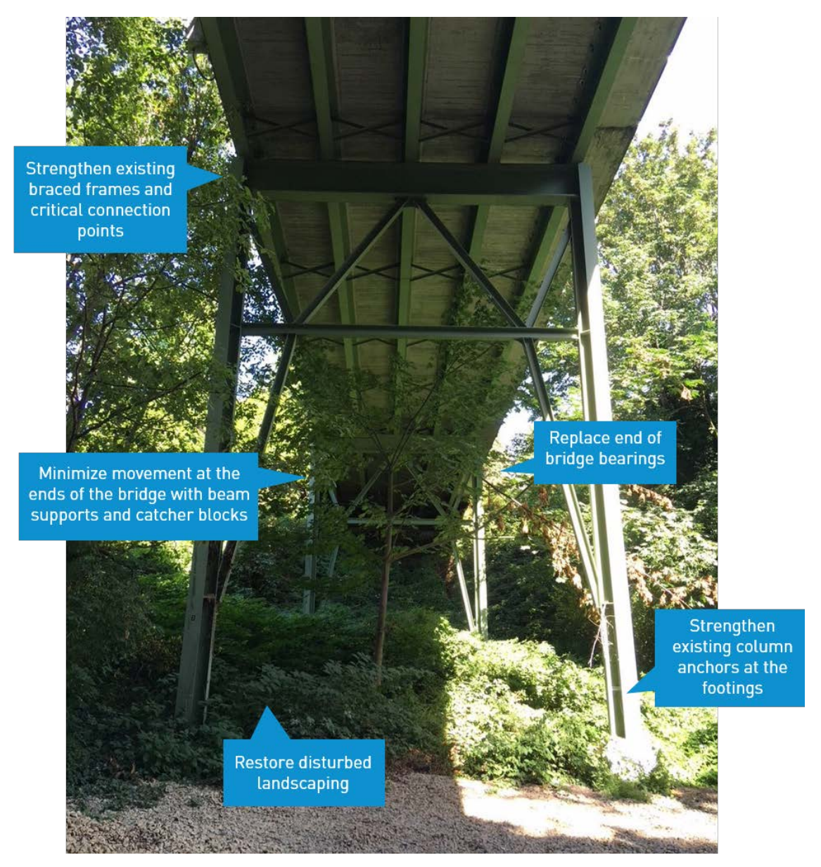
Photo of the underside of W Howe St Bridge with descriptions of planned seismic retrofits

The W Howe St Bridge was built in 1981, prior to the modernization of the seismic design code. The bridge provides an alternative connection across 32nd Ave W to the neighborhood located along the southwest edge of the Magnolia community. This work will reduce the bridge's vulnerability to earthquakes.