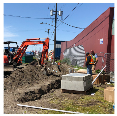
Crews work to install a new signal at 4 Ave S and S Forest St