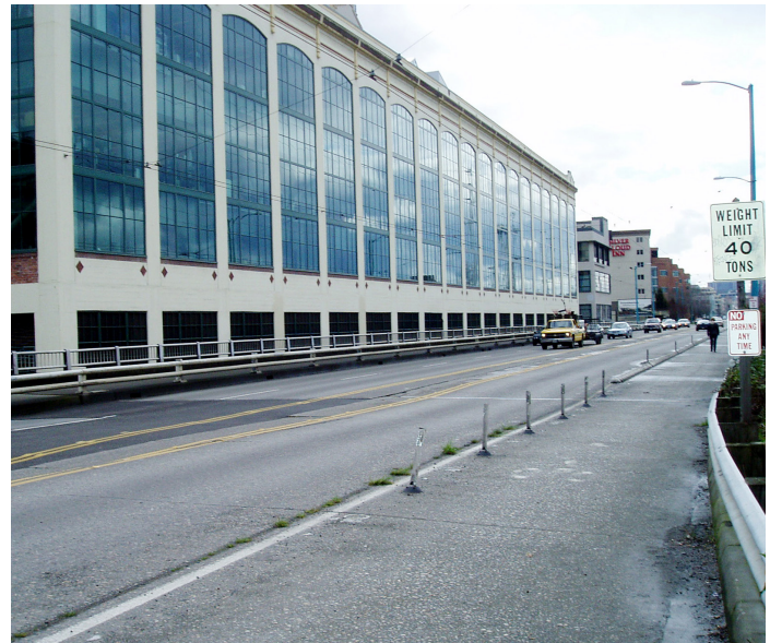
Fairview Ave N bridge directly next to the historic Lake Union Steam Plant Building (currently Zymogenetics).

The total project cost estimate is $42 million. The project is funded in three ways: Bridging the Gap, a nine-year levy for transportation maintenance and improvement; federal funding through the Bridge Replacement Advisory Committee (BRAC); and funds from the Levy to Move Seattle.