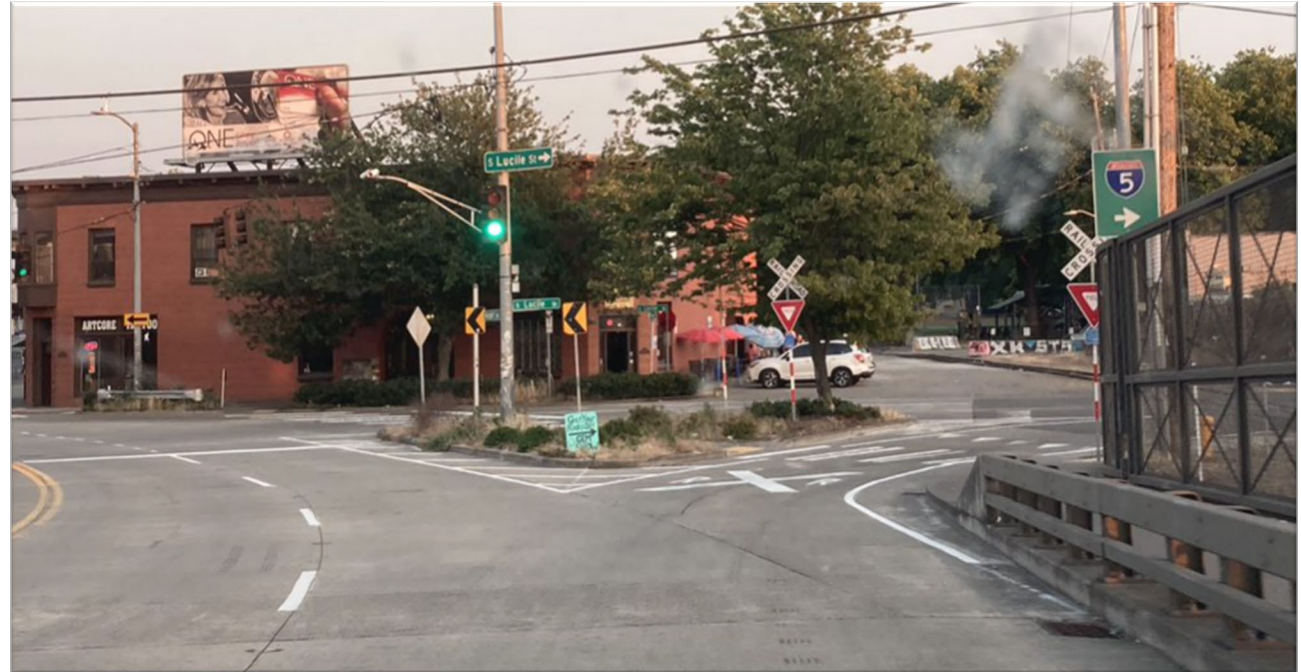
Airport Way S and S Lucile St improvements