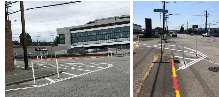
Paint and post curb bulb improvements