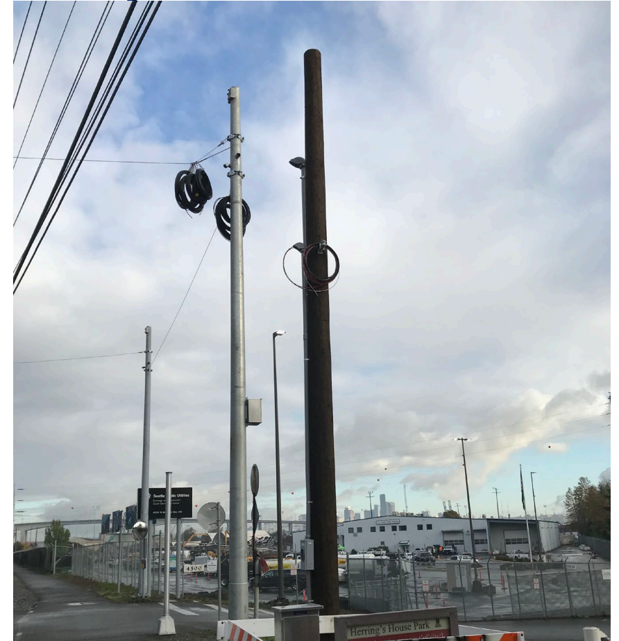
Newly installed signal pole for Duwamish Longhouse

Planning and Design underway for 10 new 2022 Projects