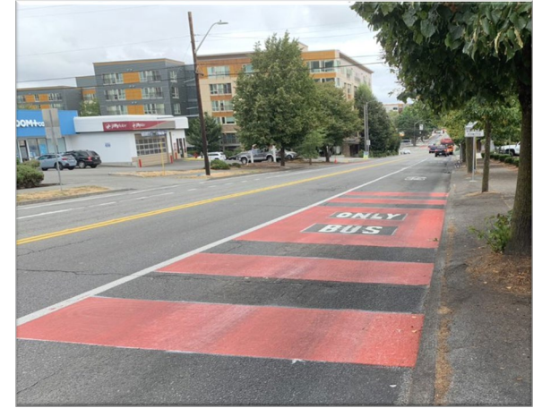
New red bus lanes on SW Alaska St