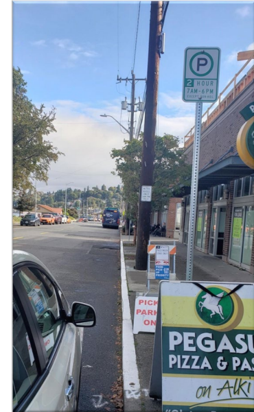
RT 50 Bus Layover Extension on Alki Ave