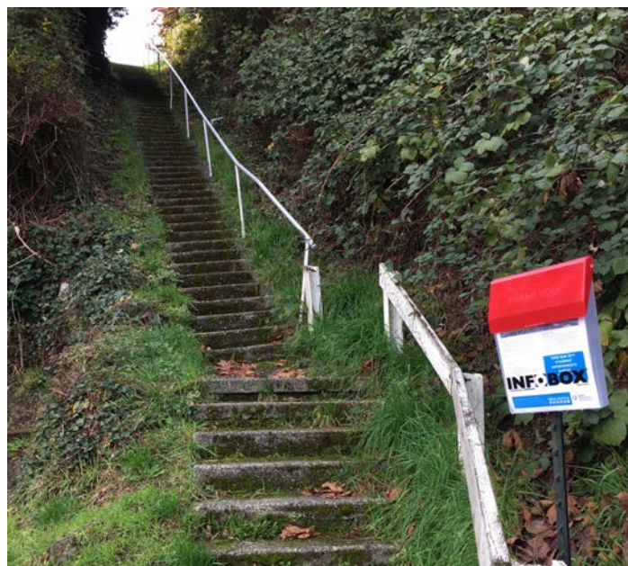
Existing stairway at Howe St between 5th Ave N and Bigelow Ave N.

This project is funded by the 9-year Levy to Move Seattle, approved by voters in 2015.