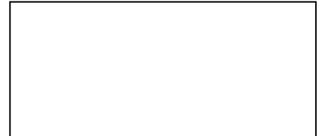
Use this space for Notary Seal