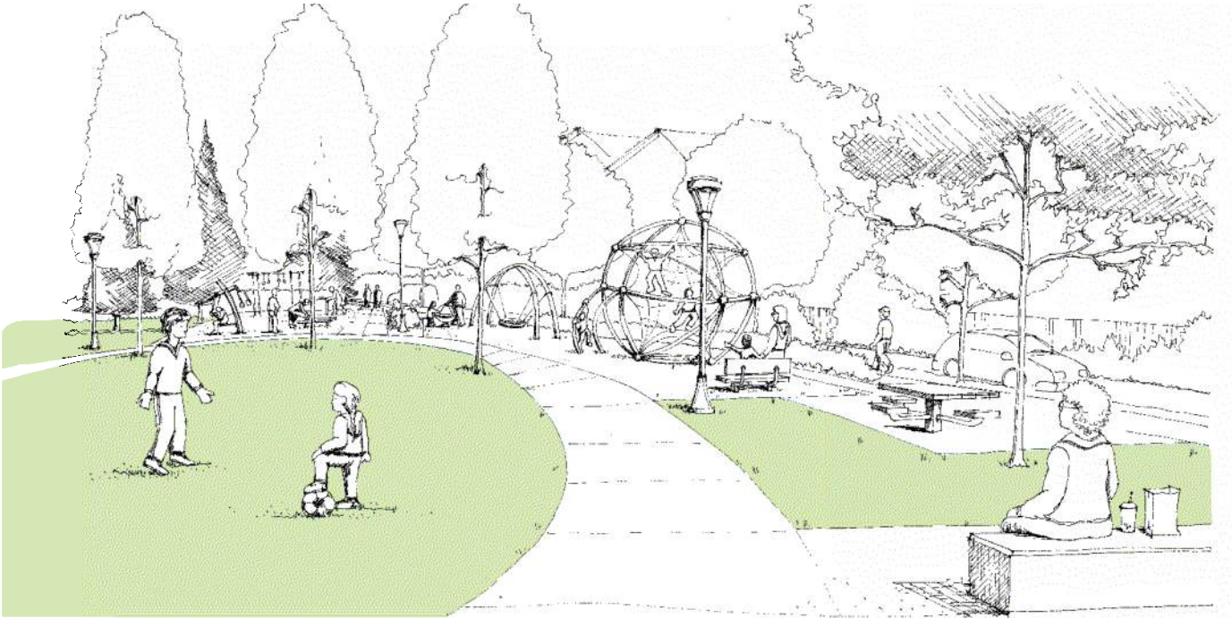
Looking North from Loop Trail