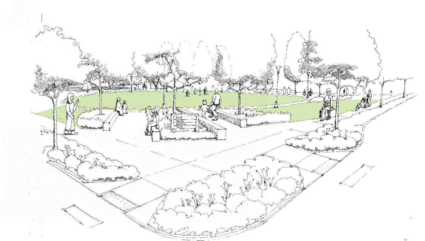
Looking Northeast from Entry