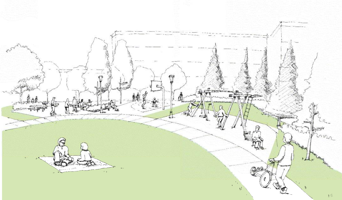
Looking West from Loop Trail