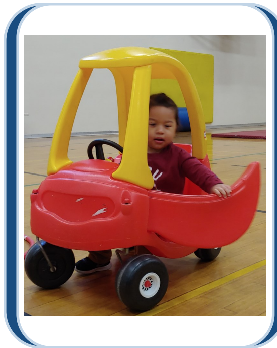
Toddler playtimes subject to change, especially during Seattle Public School closures. Call site for availability.