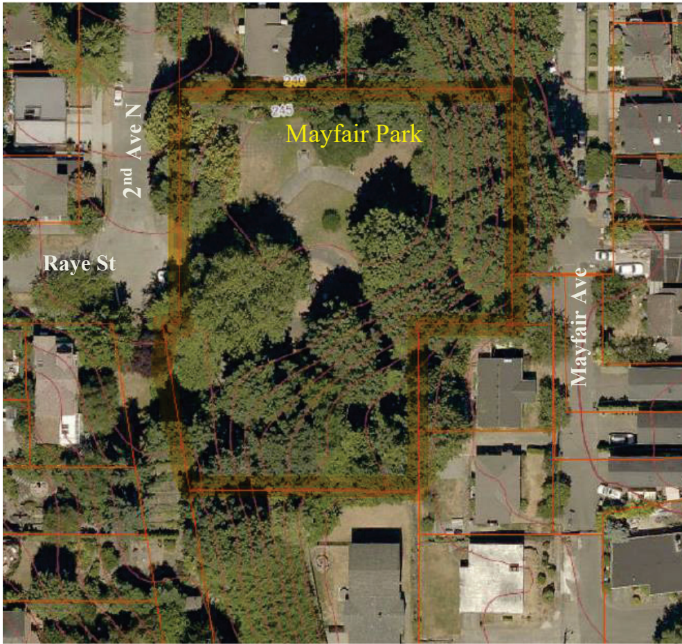
Figure Project site –King County IMap.