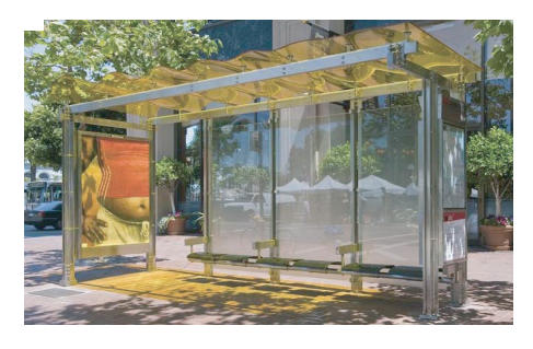
Signature bus transit station near 5th & Northgate Way