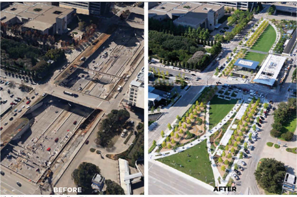
Klyde Warren Park - Dallas, TX

Seattle is a rapidly growing city. Reclaiming land in a central location could provide social, environmental, cultural, and economic benefits. Local lids include the Washington State Convention Center and Freeway Park, Seattle Municipal Tower, and Aubrey Davis Park in Mercer Island.