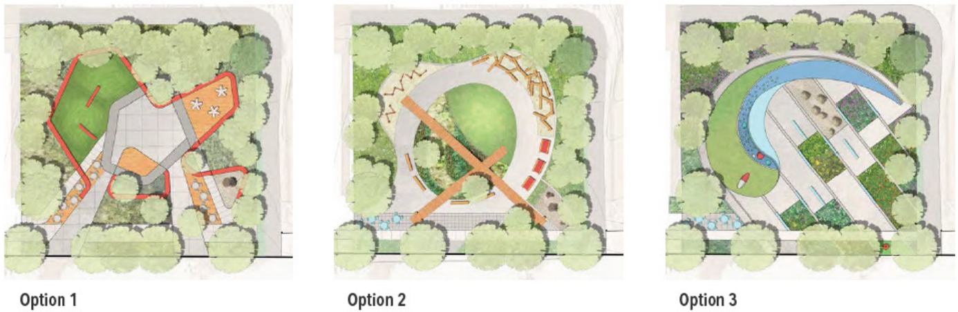
Figure 2: Proposed design concepts