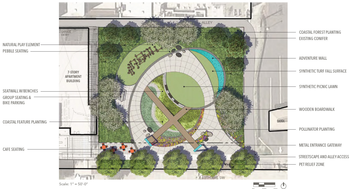
Figure 3: Preferred design alternative