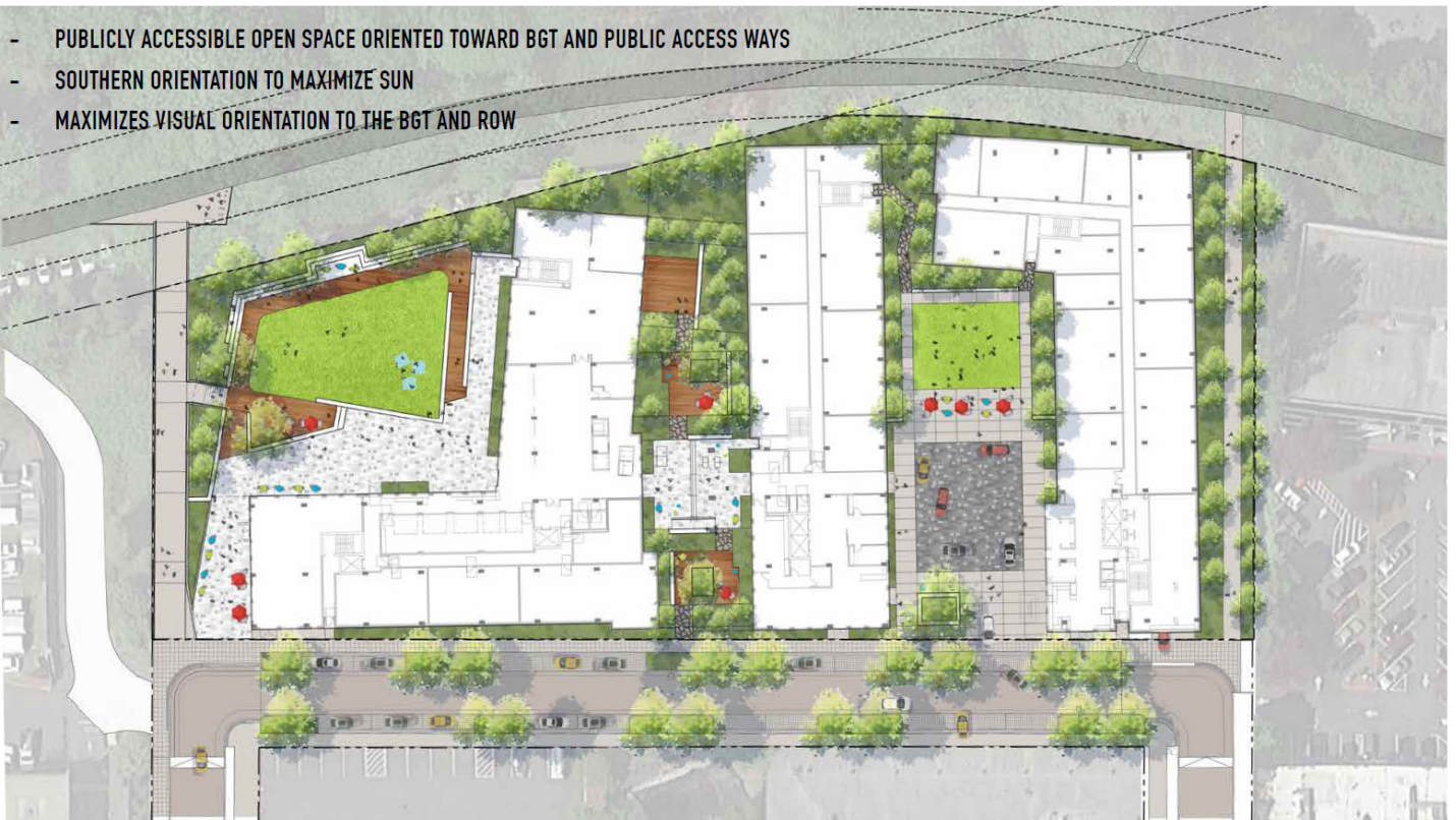
Figure 3: Proposed site plan under a vacation scenario