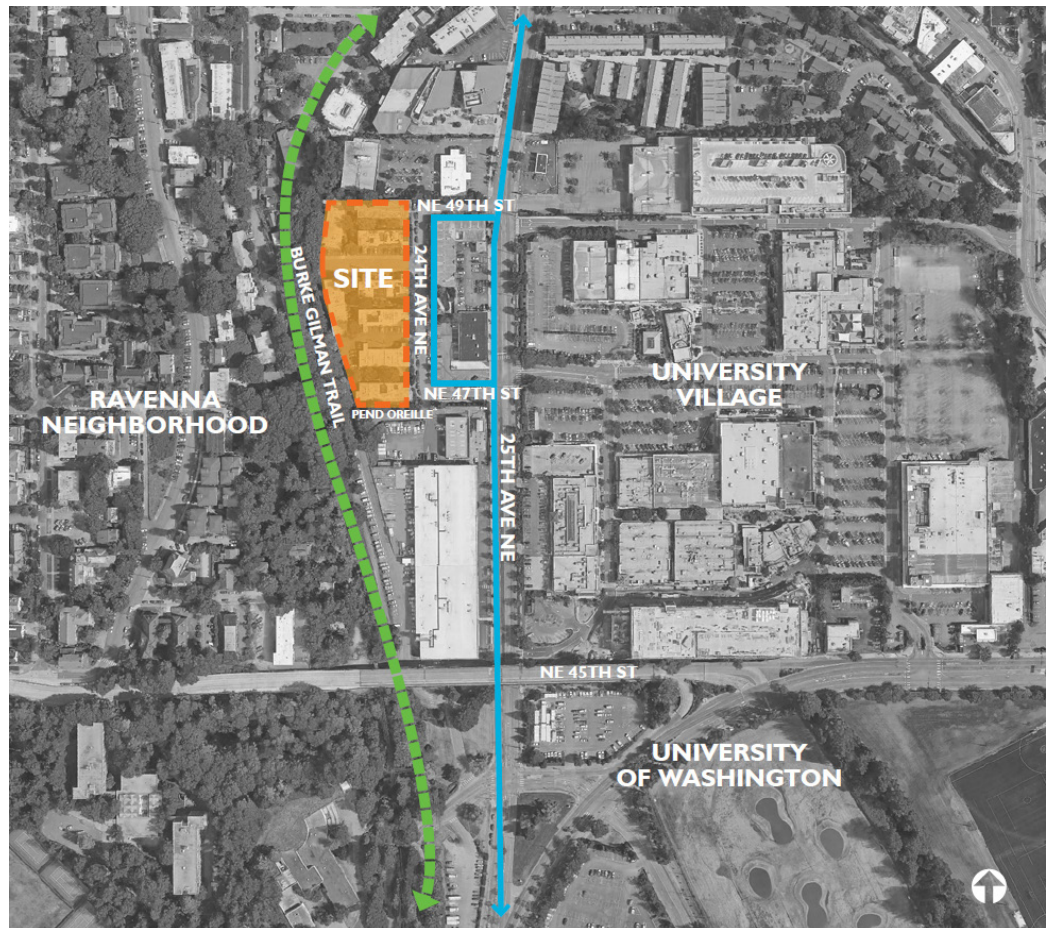
Figure 1: Location of development site