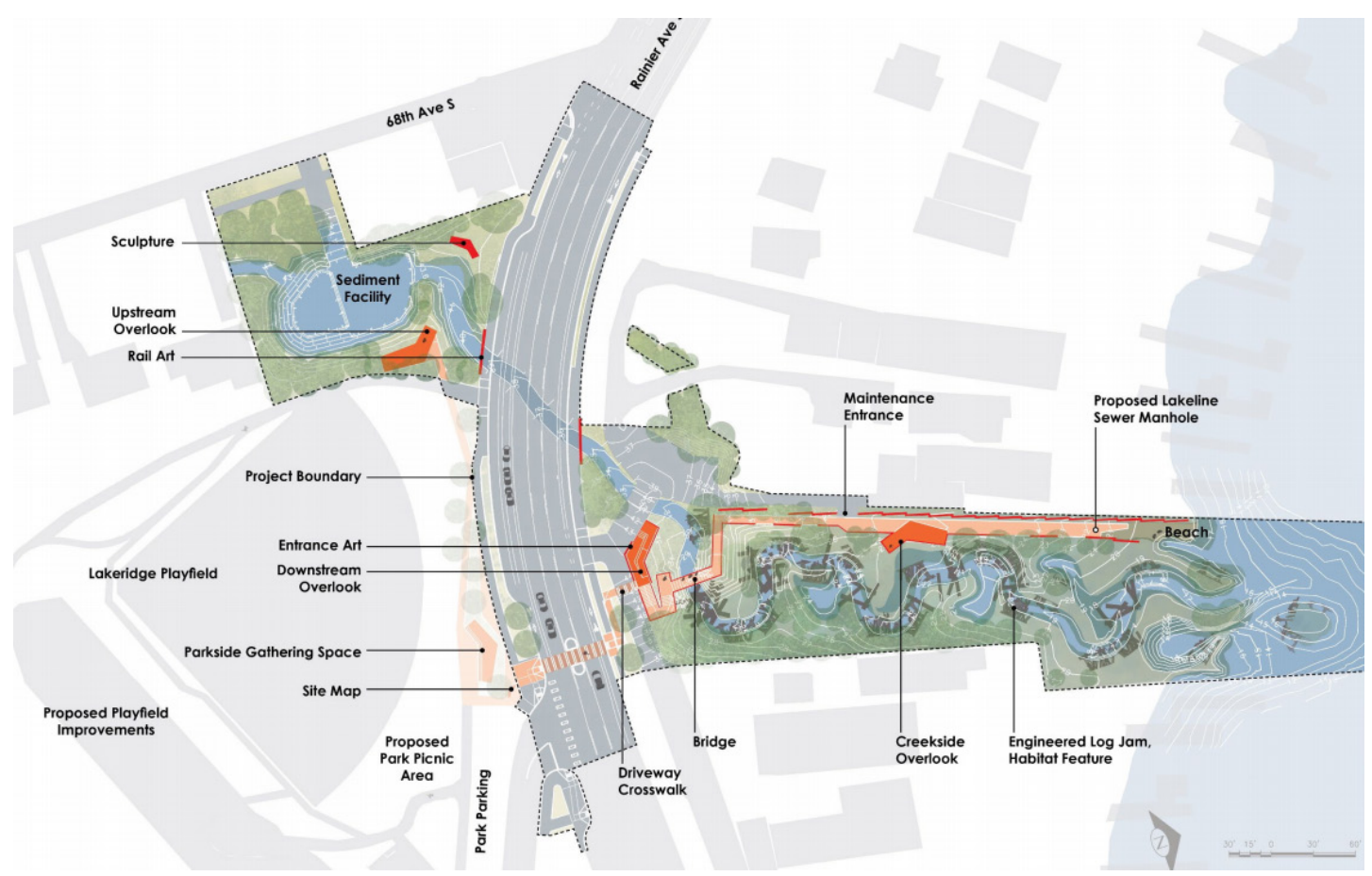
Figure 1: Updated design proposal