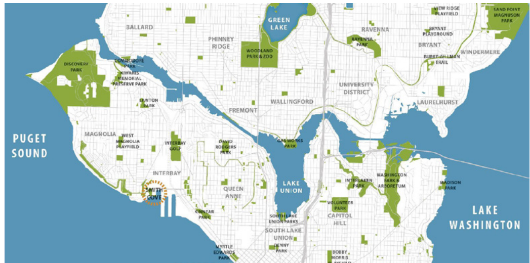
Figure 1. Context map - existing parks located near the project site.