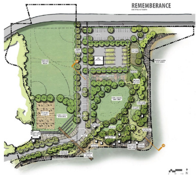
Figure 3. Design scheme 1 - Remembrance

The Commission appreciated the design team’s attention to detail while creating an overall vision for the park design, especially with the team’s decision to provide waterfront access. The Commission organized its discussion around the following issues: