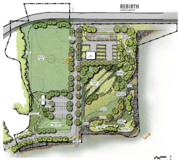
Figure 4. Design scheme 2 - Rebirth