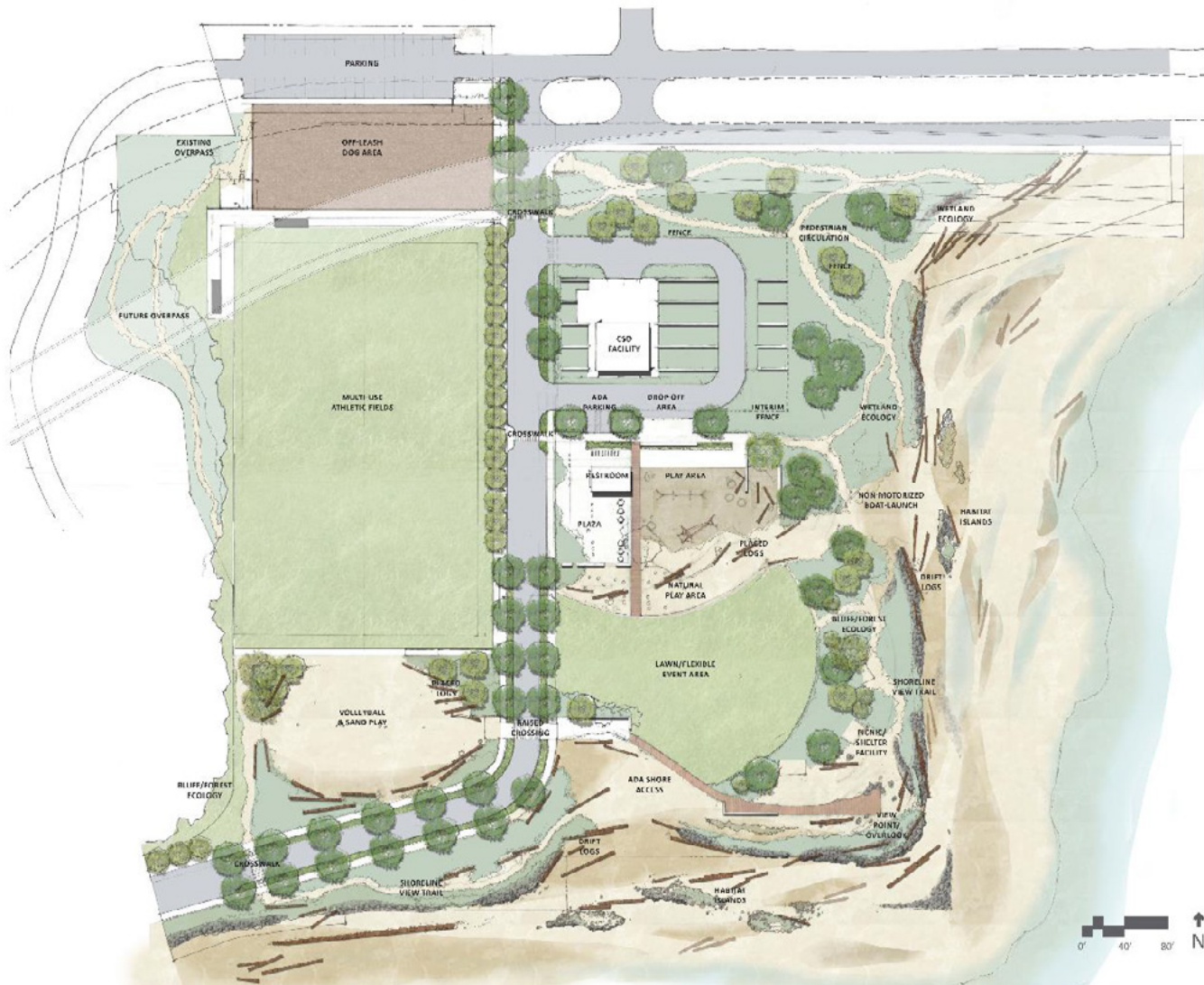
Figure 6. Preferred design scheme