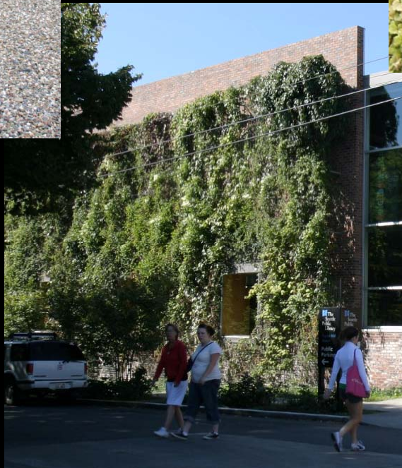
Vines and mesh