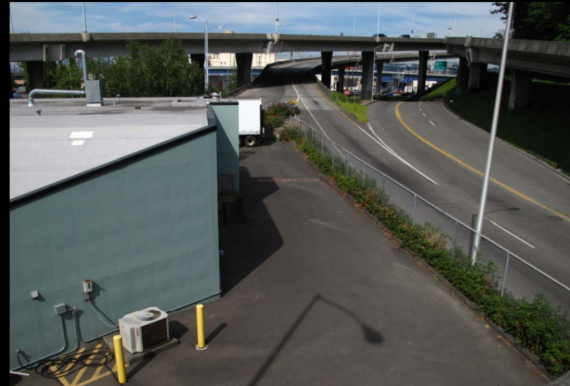
At east chain link fence