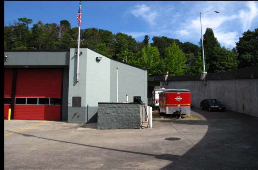
In the curve of the on ramp