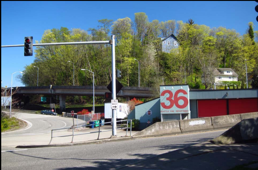
At west hand rail near on ramp