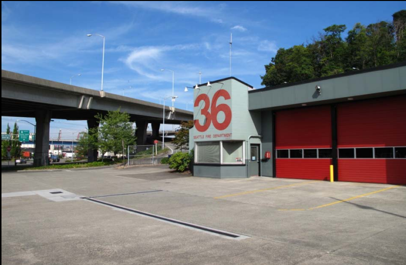
Flanking off ramp to north