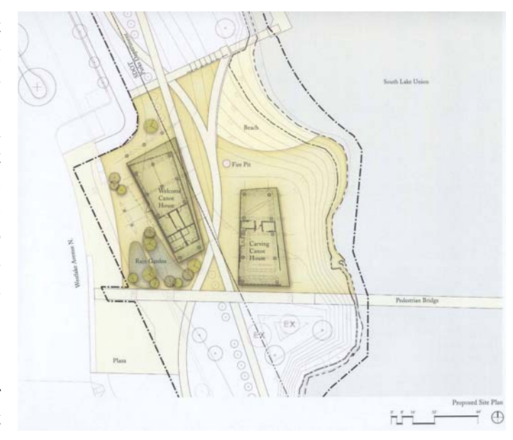
Figure 4: Canoe House Site Plan

The living roofs on the NW Canoe Center are one of the most significant sustainable features of the project. Living roofs have been around for centuries, and