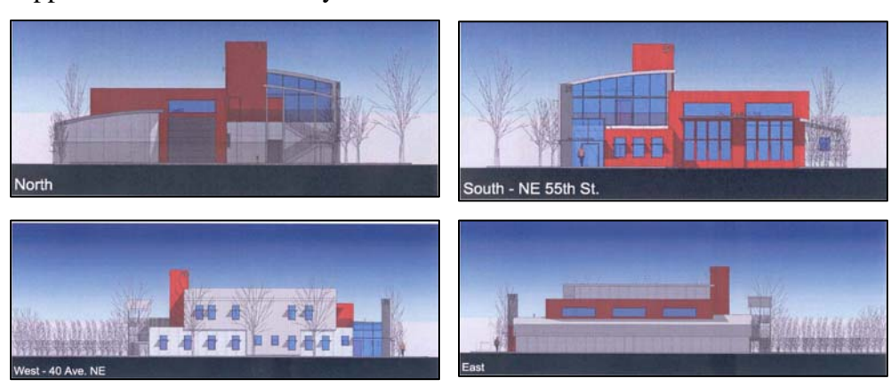
Figure 2: Fire Station 38 Elevations

Each elevation captures a different concept. The south elevation shows a sunscreen, which is a stronger horizontal element. The west side of the building will have more diminutive elements as it approaches single-family units and also because it is across the street from multi-family units. The west detail includes landscape changes from high to low elevations. There is modulation to elevation. Smaller windows will be placed in the thick shell for protection. A rain-screen will envelope the west elevation. The eastern side of the building sits on the property line and the building scale is for future potential wall. It will allow indoor natural light. The north elevation enforces support and function to the yard.