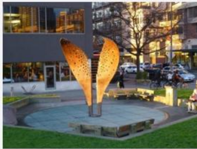
Tree of Life, Day View