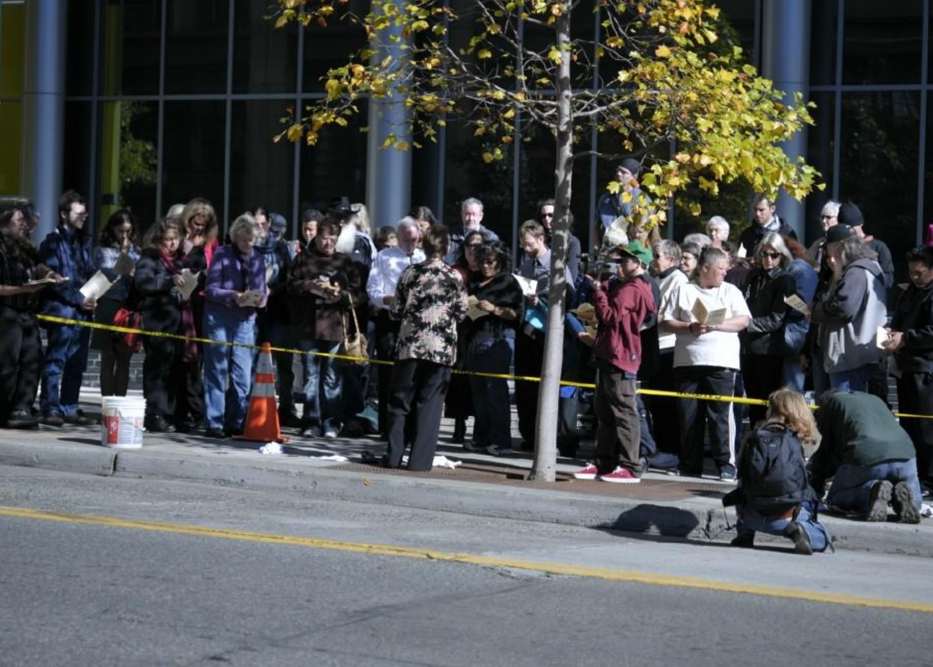
Homeless Remembrance Project