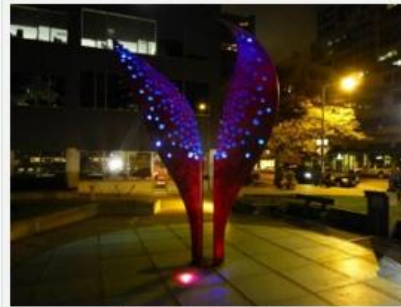
Tree of Life, Night View