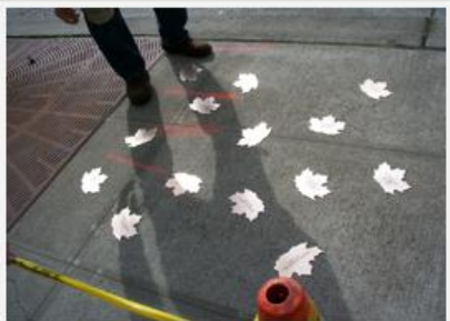
Leaves of Remembrance