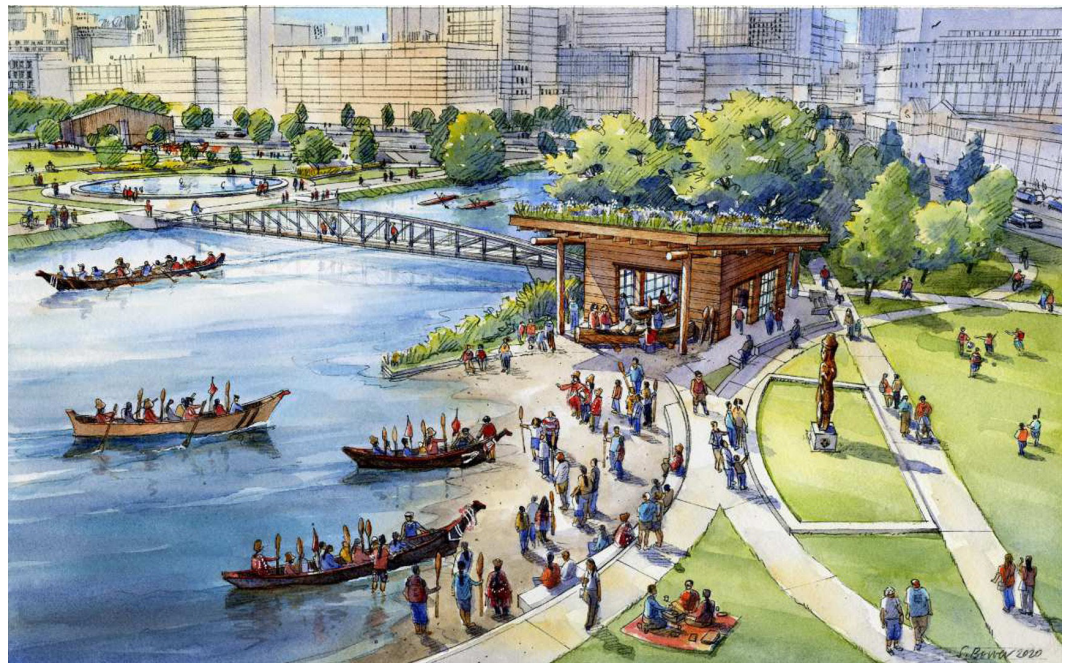
Figure 2: Project rendering

The team explained access to the site. From land and sea the UIATF desired the facility to have a Coast Salish appearance. Welcome Figures were commissioned, which would provide orientation and cultural identity. Directional blade signs were planned to augment the SPR standard signage systems in the park.