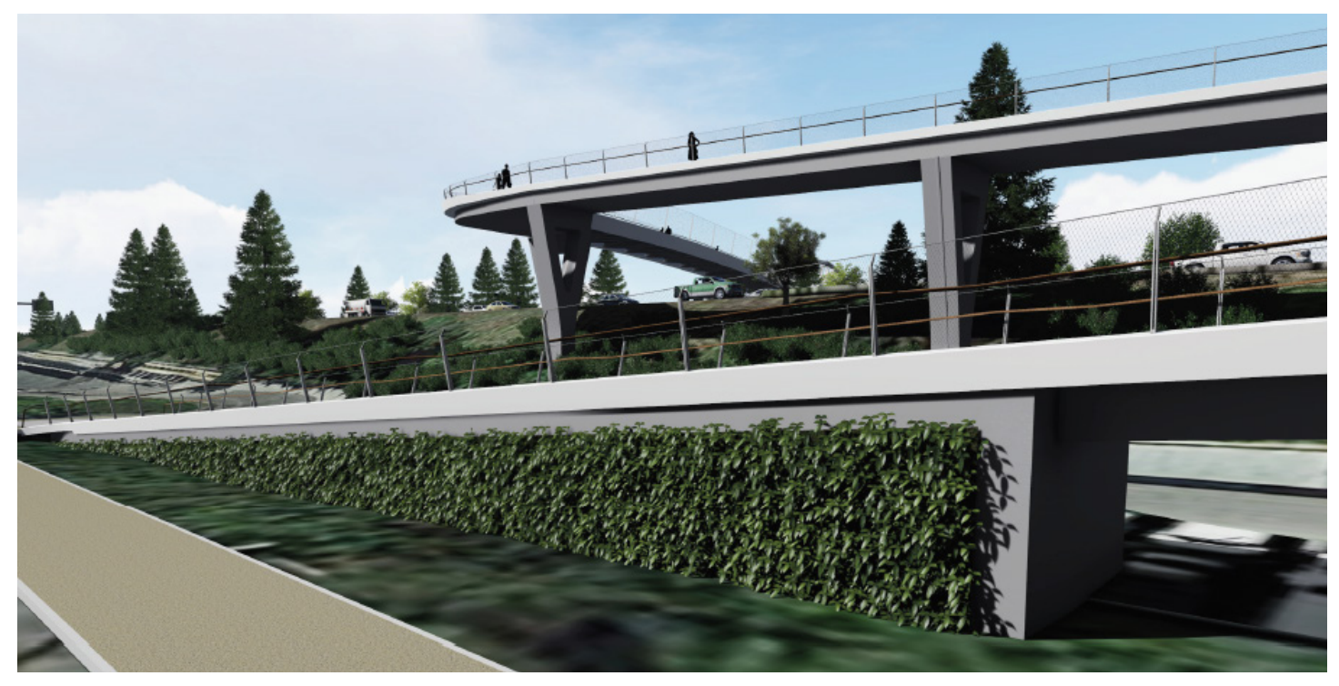
Figure 4. Geofoam wall

The bridge will terminate at the intersection of NE 100th St and 1st Ave NE on the east end and to the west at North Seattle College's eastern parking lots. There are at-grade landings on both ends of the bridge, providing potential pedestrian and bicyclist mixing zones. An additional connection is proposed at the mezzanine level of Northgate Station. The updated design eliminates the need to obtain the WSDOT parking lot at NE 100th and 1st Ave NE for the ramping system. The design includes an 8.3% slope on the west and east approach in order to accommodate the atgrade connection and direct pedestrian access. The updated design also includes a geofoam wall, 240 feet in length, along the west approach. The proposed wall will include a textured concrete finish with vining plants attached.