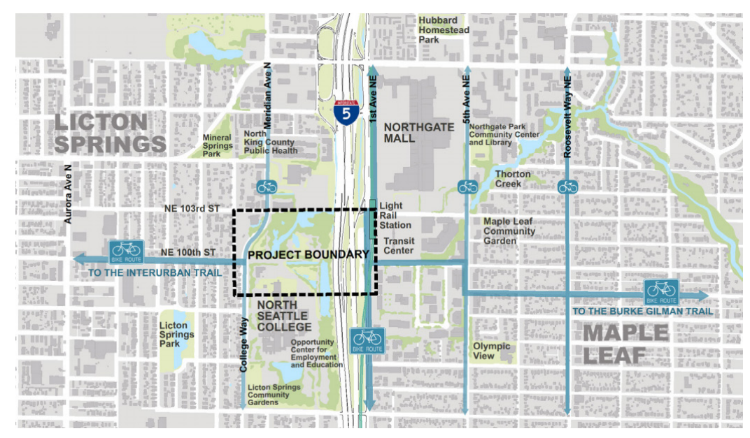
Figure 1. Site context map

Amanda Tse of SDOT and Eric Birkhauser of VIA Architecture presented the concept design phase for the Northgate Pedestrian Bridge project. Amanda Tse provided an overview of the project including significant design updates that have been made since the last presentation held in September 2015. The project was placed on hold in early 2016 due to budget constraints. The project was reactivated in late 2016 with a new design team and reduced budget. The design team has maintained the intent, goals, and character of the initial design proposal while modifying designs to both approaches, main span, and proposed alignment in order to meet the current budget.