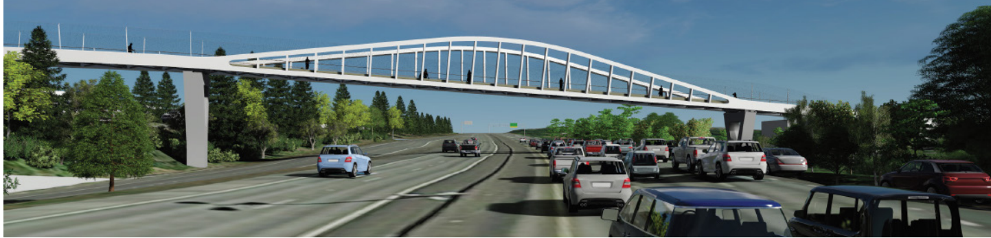
Figure 3. Initial tube truss design across 15 compared to revised open truss design

The bridge will terminate at the intersection of NE 100th St and 1st Ave NE on the east end and to the west at North Seattle College's eastern parking lots. There are at-grade landings on both ends of the bridge, providing potential pedestrian and bicyclist mixing zones. An additional connection is proposed at the mezzanine level of Northgate Station. The updated design eliminates the need to obtain the WSDOT parking lot at NE 100th and 1st Ave NE for the ramping system. The design includes an 8.3% slope on the west and east approach in order to accommodate the atgrade connection and direct pedestrian access. The updated design also includes a geofoam wall, 240 feet in length, along the west approach. The proposed wall will include a textured concrete finish with vining plants attached.