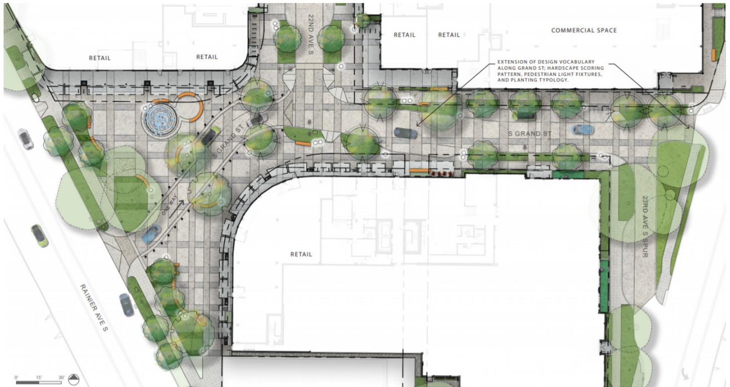
Figure 2: Updated Design Proposal