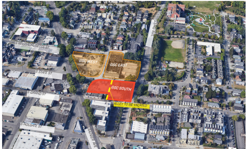
Figure 1: Project location