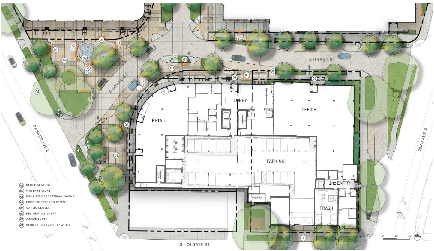
Figure 2: Preferred design proposal with alley vacation

scenario would not provide for a realignment of S Grand St and would not eliminate a curb cut onto S Grand St.