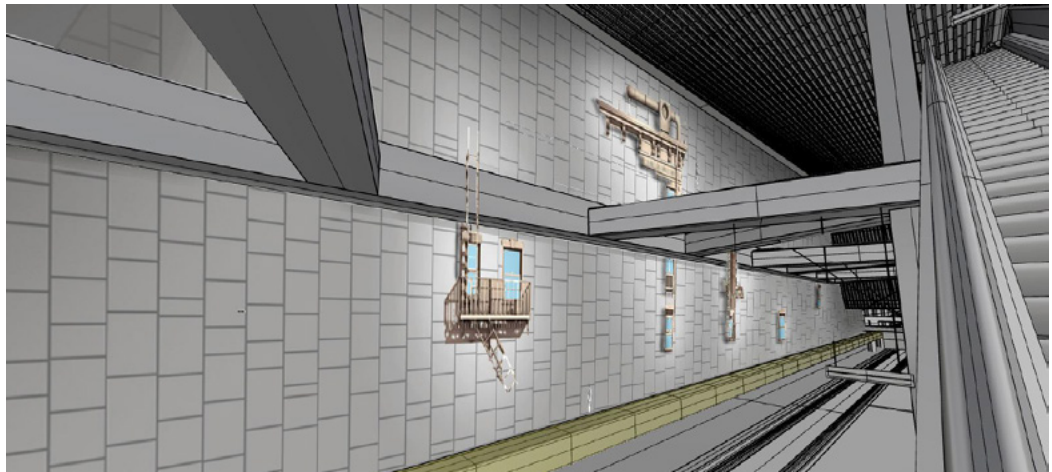
Figure 2: View of proposed art from station platform