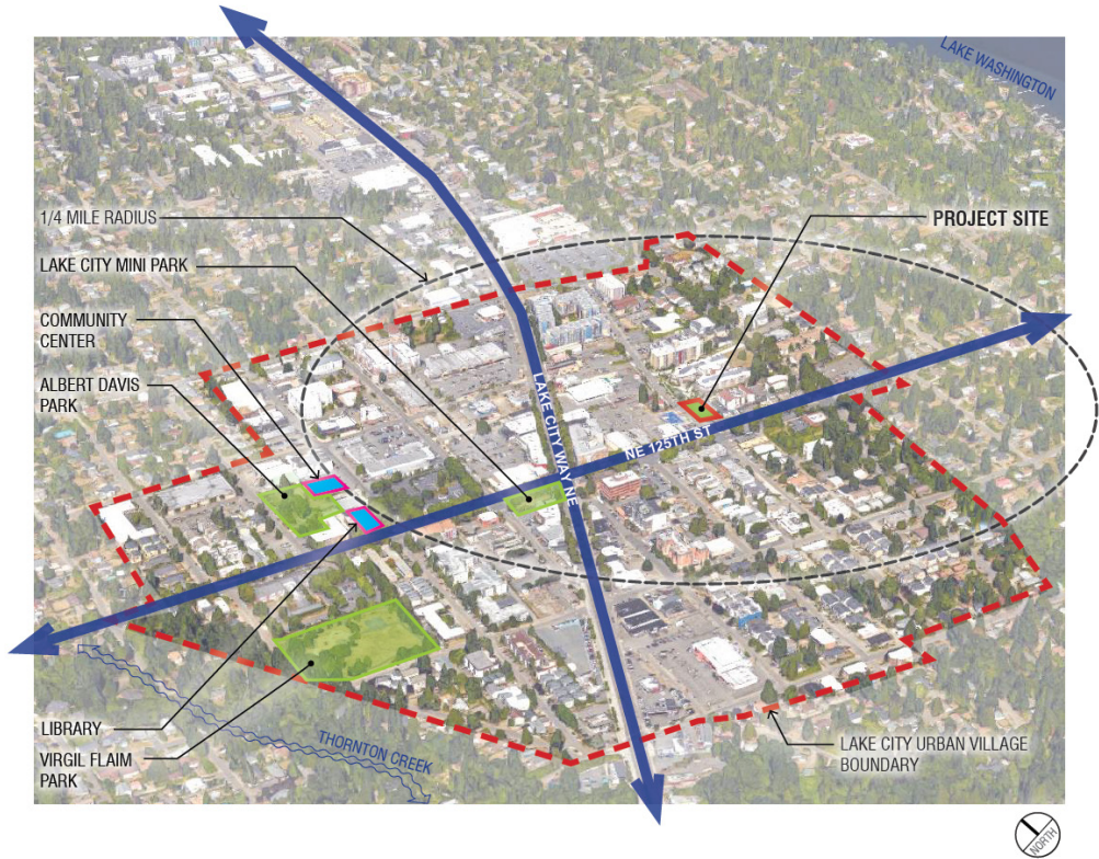
Figure 1. Site context

Zack Thomas of Board and Vellum presented the concept design phase of the Lake City Landbanked Site project. Zack Thomas provided an overview of the project, site context, and background information. The project site is located on a 10,000 sf vacant parcel near the northeast corner of the NE 125th St and 33rd Ave NE intersection. The project site was acquired by Seattle Parks and Recreation (SPR) in 2010 and has a total budget of approximately $1,000,000. Additional funding has been secured for the art program and bicycle facilities.