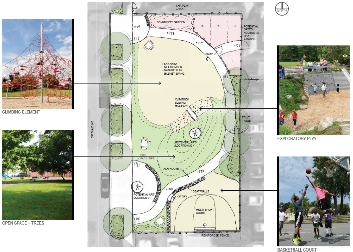
Figure 3. Hybrid schematic design

Accordingly, the proposed design is a hybrid of Options A and C. The proposed design includes a central curvilinear pathway, basketball court, seating, community garden area, p-patch, welcoming park entrance, artwork, bicycle facilities, open lawn area, and play area with net climber and slide. The proposed design will further integrate with the surrounding context through adjacent streetscape improvements, improving access, and providing gathering spaces for active and passive recreation.