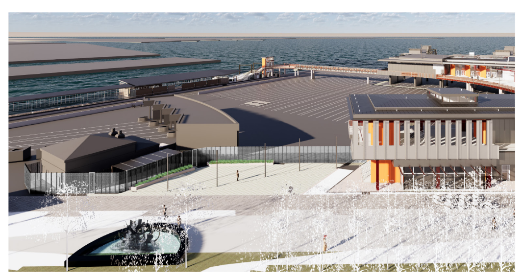
Figure 1: View of south end of terminal building

The updated design for the terminal building reduces the facility by 40 feet on the south end in order to avoid spanning a seismic joint located on the pier. Other design revisions to the terminal building included the removal of the south escalator on the south end of the facility as well as the removal of an elevator on the north end. The updated design also includes the addition of glass panels on the top floor of the south end of the facility to place emphasis on the entry point below. All entry points from Alaskan Way and the Marion St Bridge include recessed gates that will be used lowered during non-hours of operation, from 2-5 am.