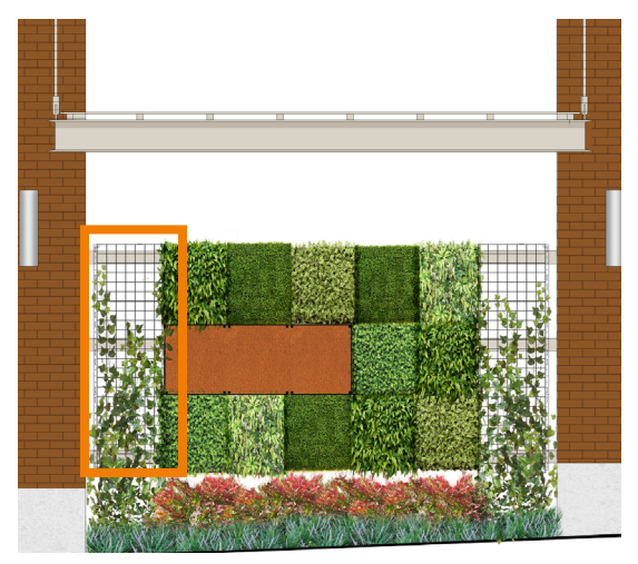
On the green wall, the Commission recommended eliminating the vines and suggested modifying the width of the metal screens adjacent to the plantings.