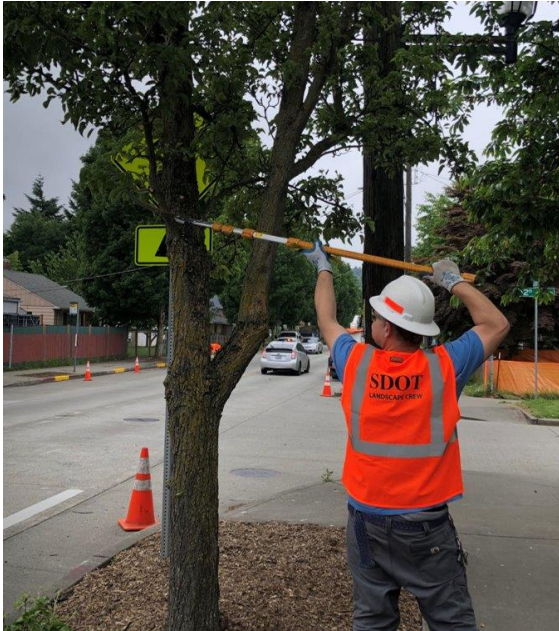
SDOT worker pruning tree limbs.