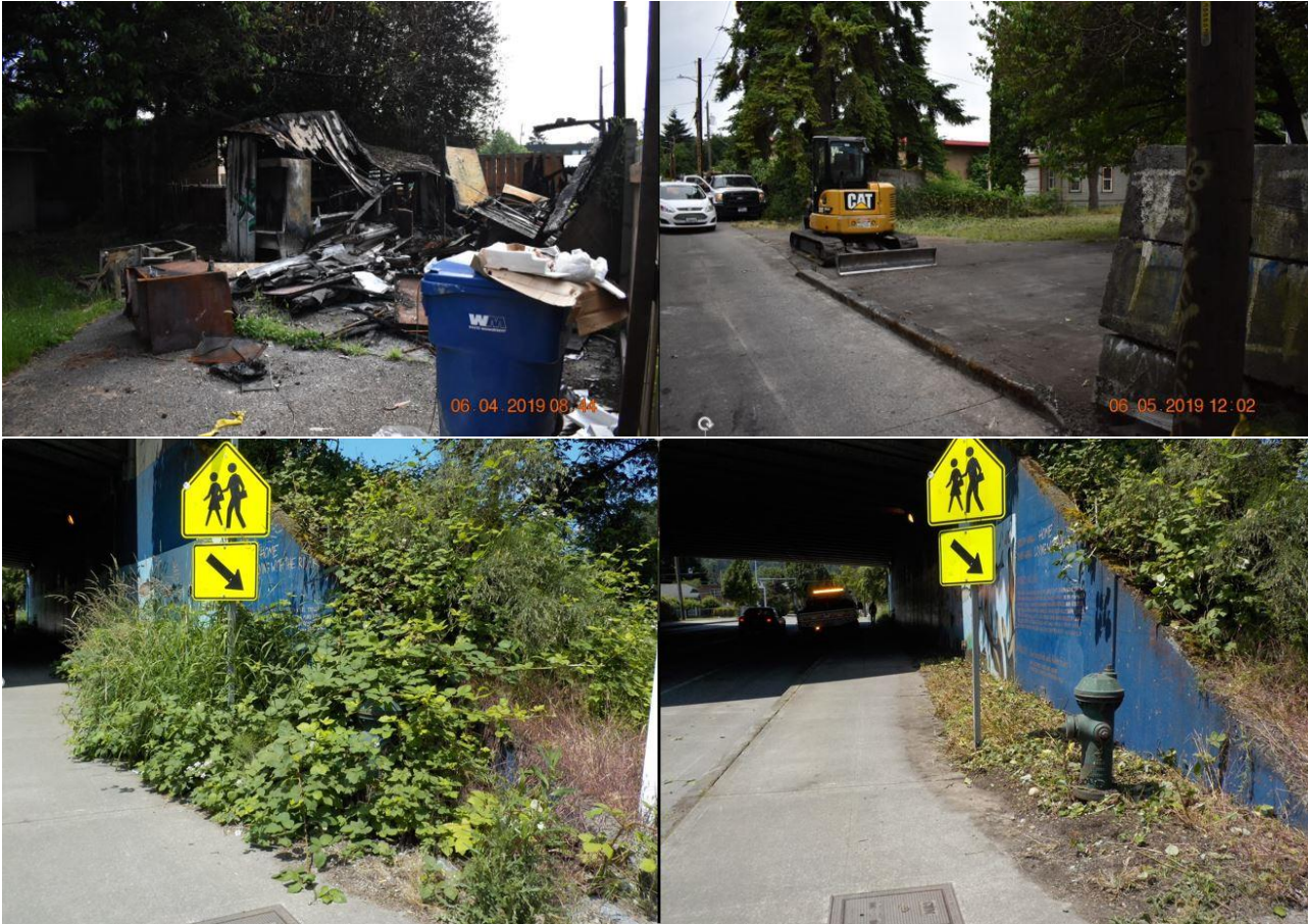
Before and after photos of cleanups in South Park.