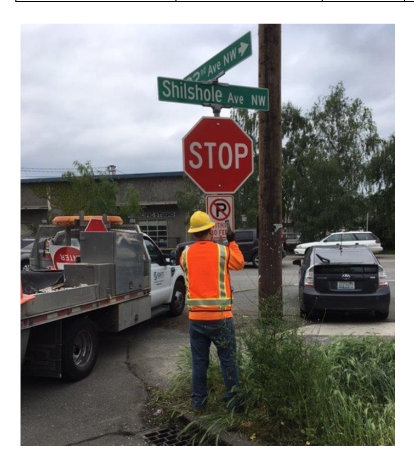
SDOT Employee repairs street sign in Ballard.