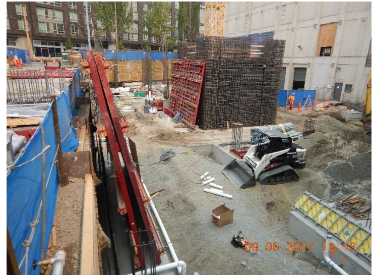
Looking North Central Elevator Core Rebar