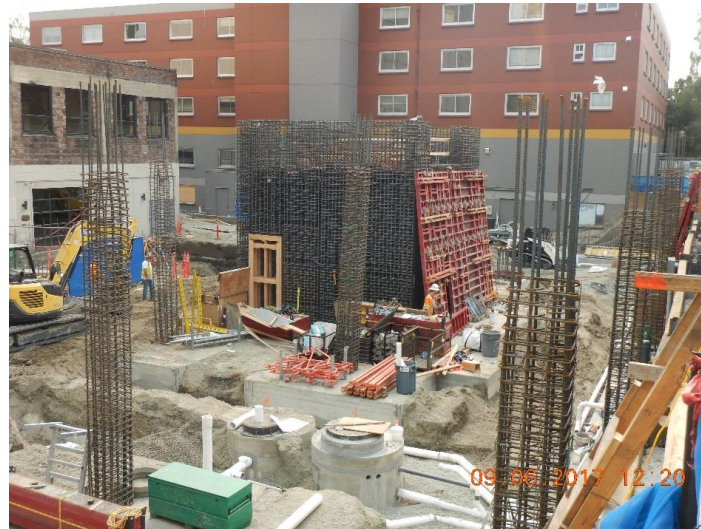
Looking South Underground Utilities