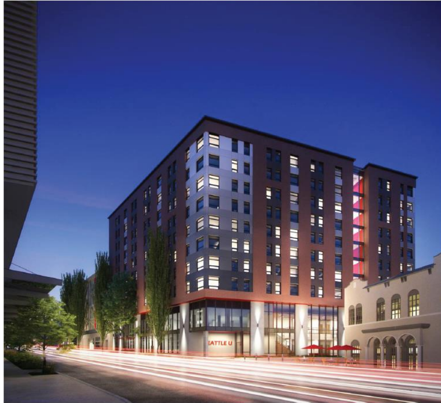
NIGHT VIEW ON EAST MADISON STREET