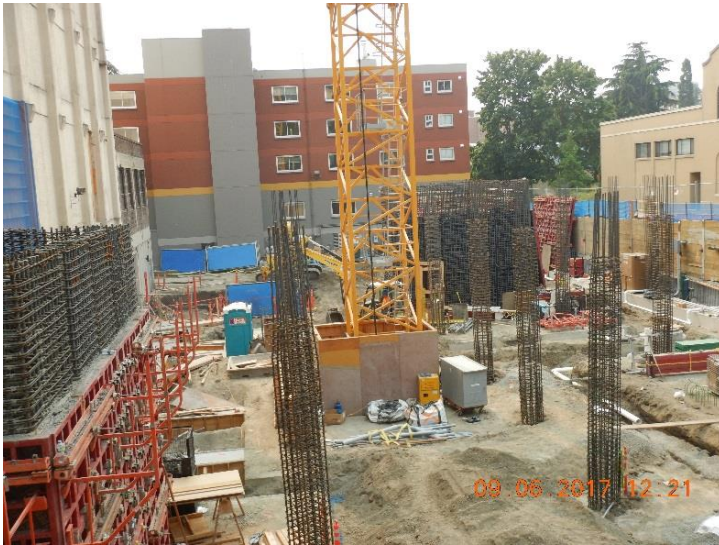
Looking South Columns and North Stair Rebar