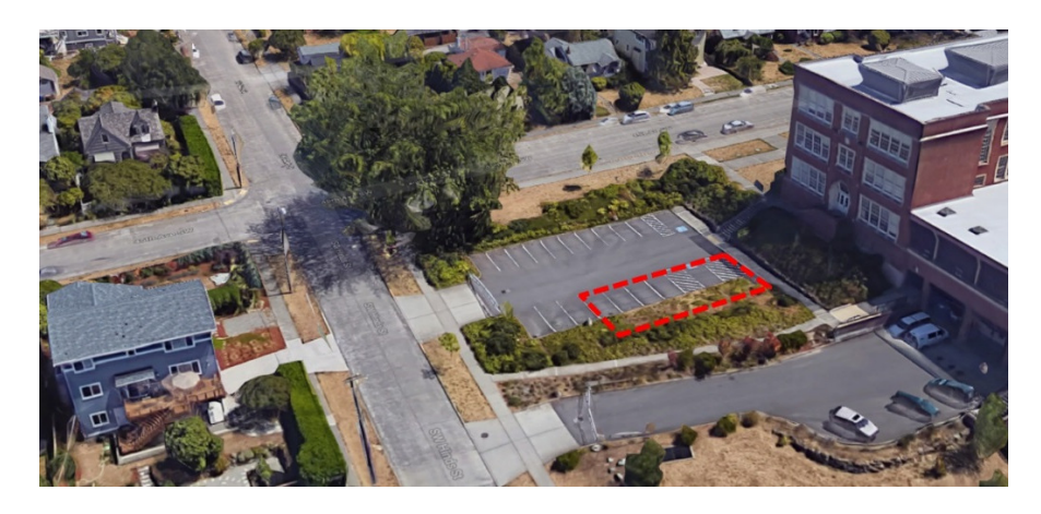
Exhibit 1 Proposed Site Plan

Enrollment projections beyond 2018-2019 show continued increase and continued need for the portables. Although the timeframe for removal of the portables is unknown, the Seattle Public Schools Capital Planning is evaluating long-term solutions to capacity at Madison Middle School.