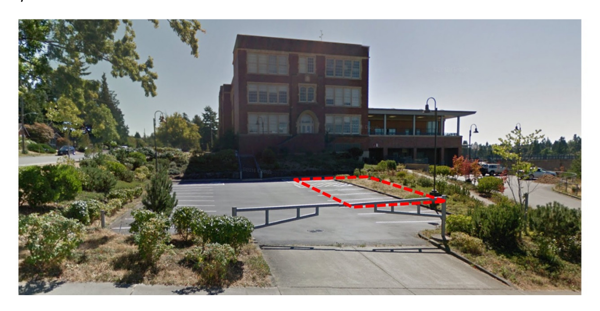
Exhibit 2 Existing Site Plan

Madison Middle School's site is bifurcated by a steep slope running north-south at roughly the site's midpoint. The original building and addition sit at the top of the slope to the east and the athletic/track field sit down the slope to the west. It had a major remodel and addition in 2005. The school is in a predominantly single-family residential neighborhood; the current zoning classification of the school site and surrounding areas are SF5000 (residential single-family 5,000).