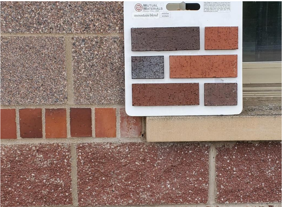
PROPOSED BRICK BLEND VS 2005 ADDITION