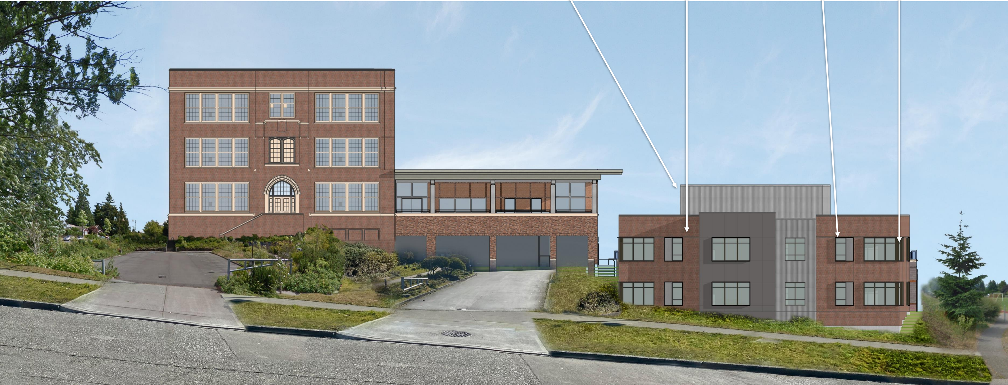
NORTH ELEVATION ALONG SW HINDS ST – BRICK CORNER VOLUMES WITH VERTICAL METAL SIDING (PREFERRED OPTION)

PROPOSED ADDITION USING CORNER WINDOWS TO PROVIDE SITELINES OF PROMINENT VIEWS