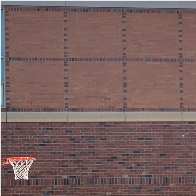
EXISTING BRICK DETAILING