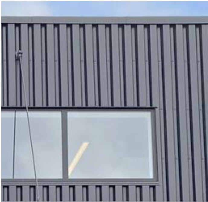
PROPOSED BOX RIB METAL PANEL