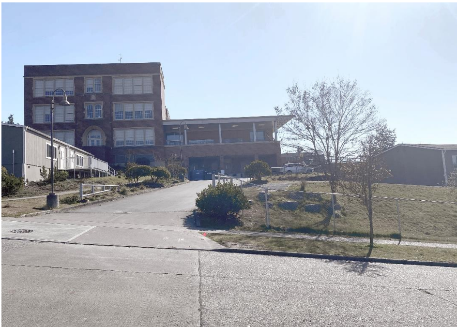
VIEW FROM SW HINDS ST TOWARDS LOADING DOCK