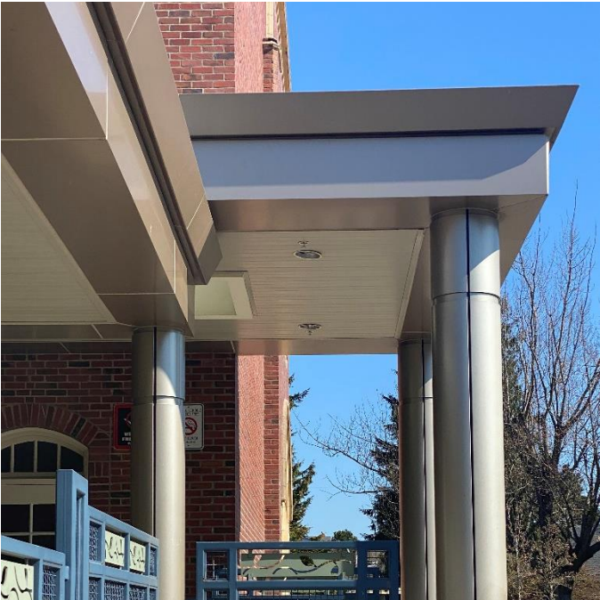
EXISTING METAL PANEL