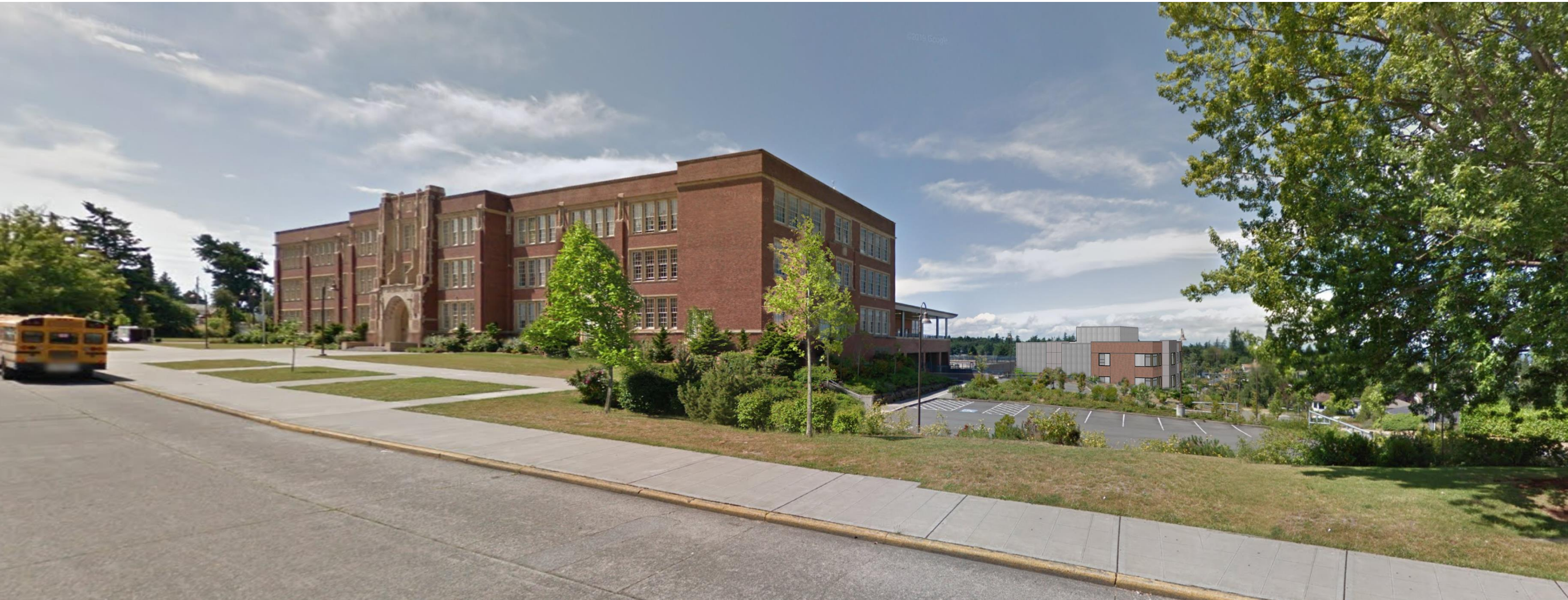
VIEW LOOKING WEST FROM ALONG 45TH AVE SW – BRICK CORNER VOLUMES WITH VERTICAL METAL SIDING