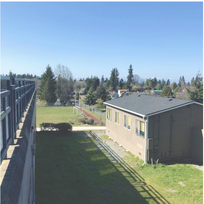
VIEW FROM COURTYARD TERRACE LOOKING TOWARDS NEW ADDITION