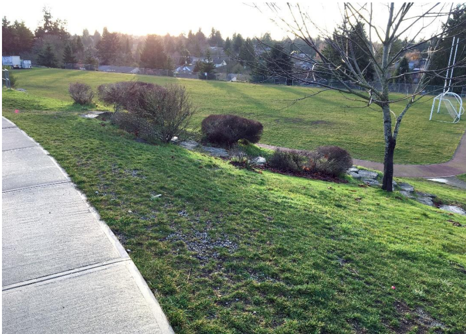
VIEW FROM NEW ADDITION LOOKING SOUTHWEST