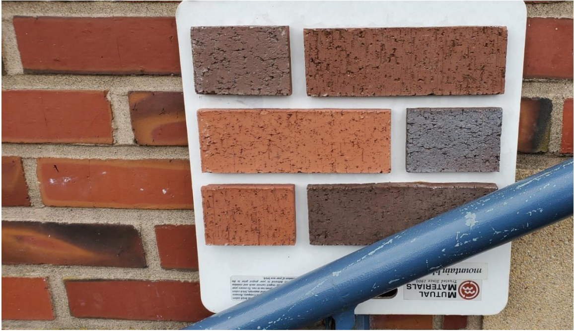
PROPOSED BRICK BLEND VS 1920 ORIGINAL BUILDING