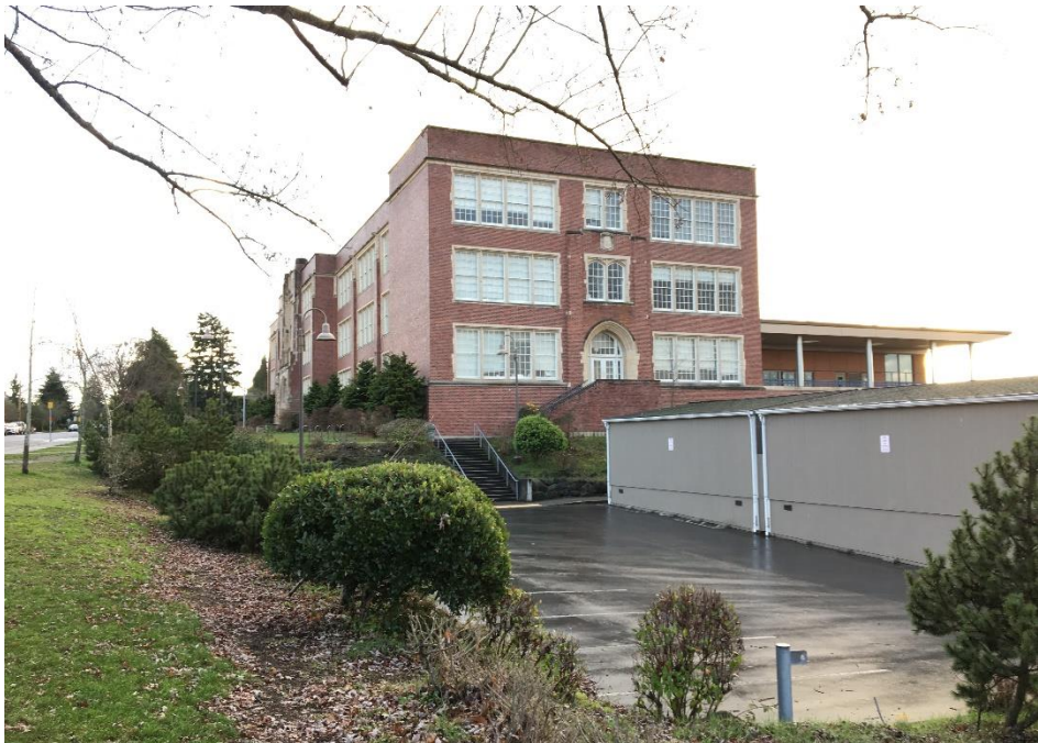
VIEW FROM 45 TH AND SW HINDS