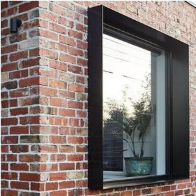
PROPOSED SUN SHADE DETAILING