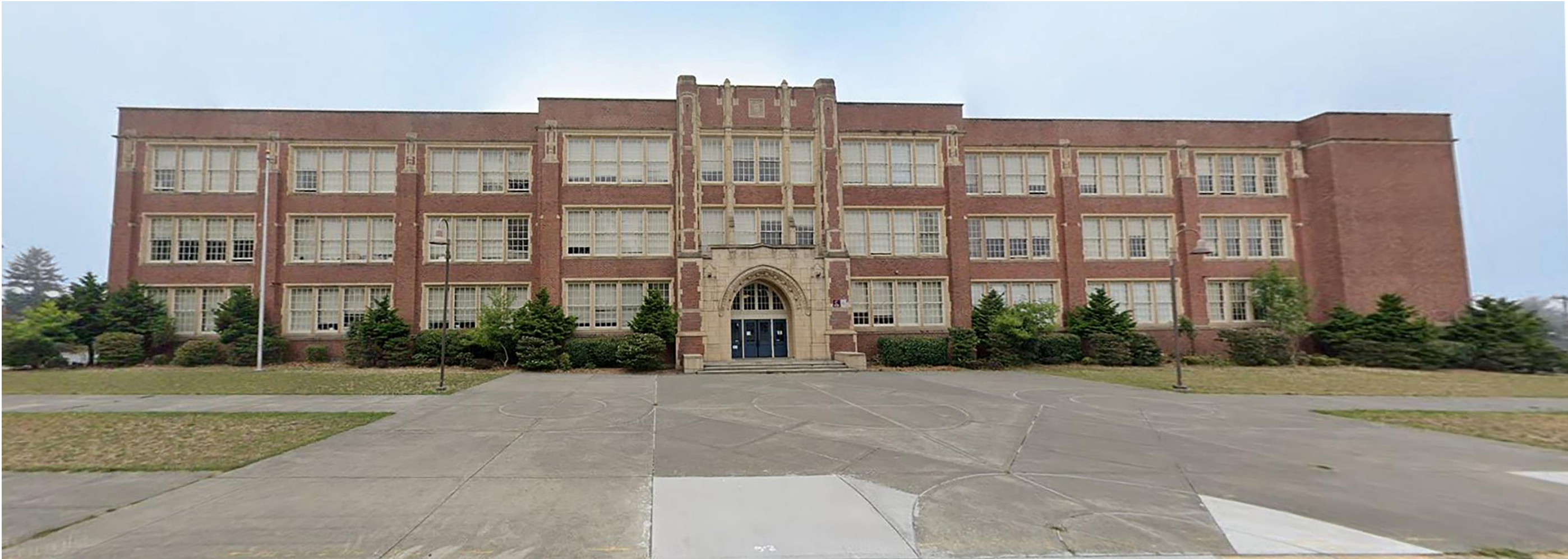
MADISON MIDDLE SCHOOL ENTRANCE FROM 45 TH AVE SW