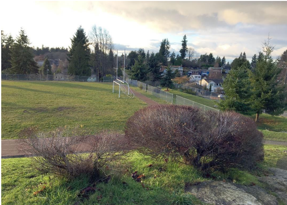
VIEW FROM NEW ADDITION LOOKING WEST