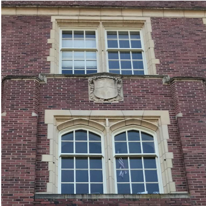
EXISTING STONE DETAIL