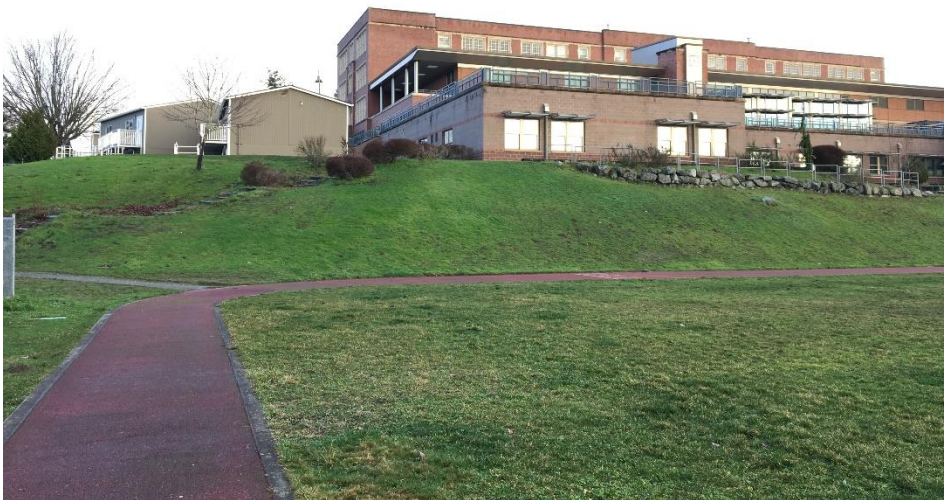
VIEW FROM ATHLETIC FIELD TOWARDS NEW ADDITION