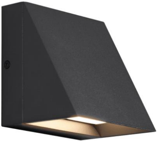
PROPOSED EXTERIOR DOWN LIGHTING