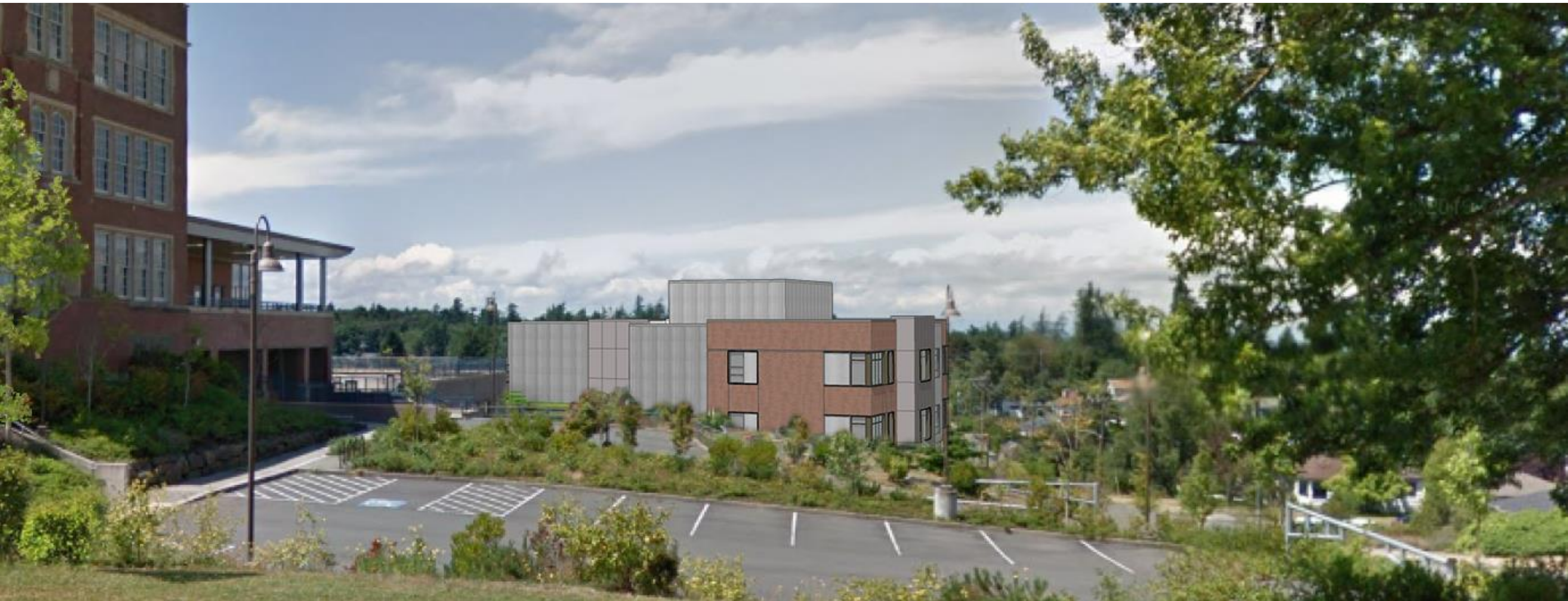
VIEW LOOKING WEST FROM ALONG 45TH AVE SW – BRICK CORNER VOLUMES WITH VERTICAL METAL SIDING