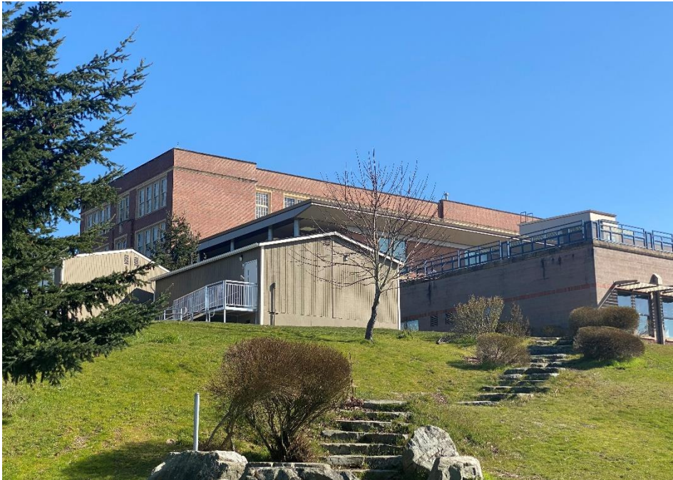
VIEW FROM SITE PEDESTRIAN ENTRANCE TOWARDS NEW ADDITION