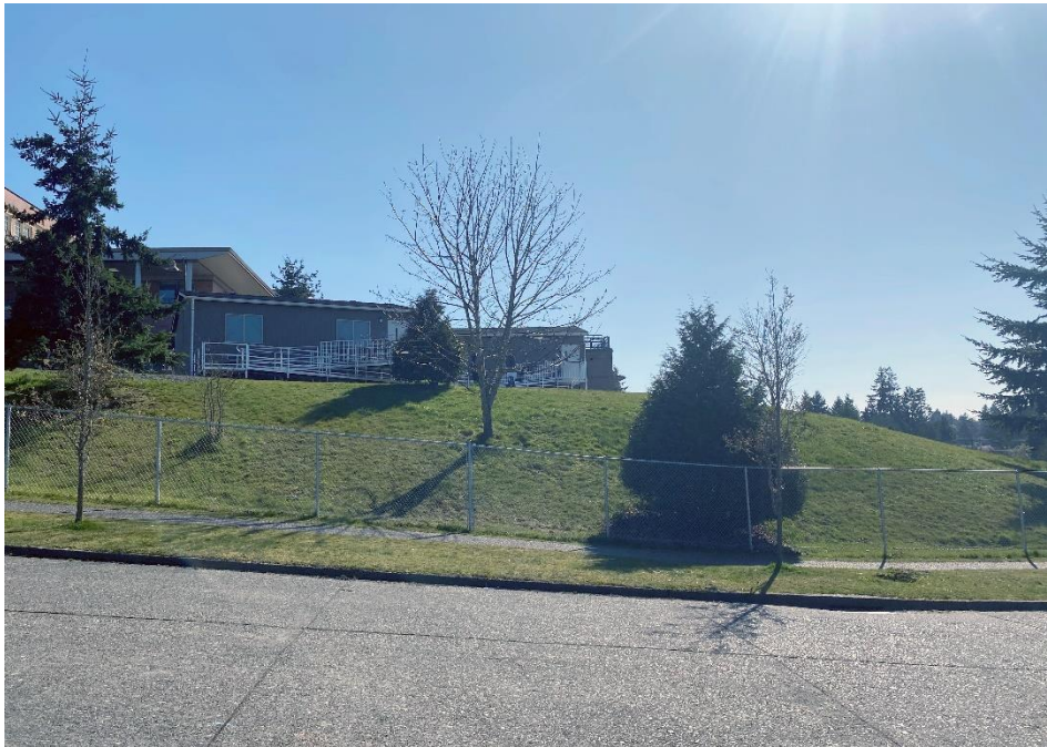
VIEW FROM SW HINDS ST