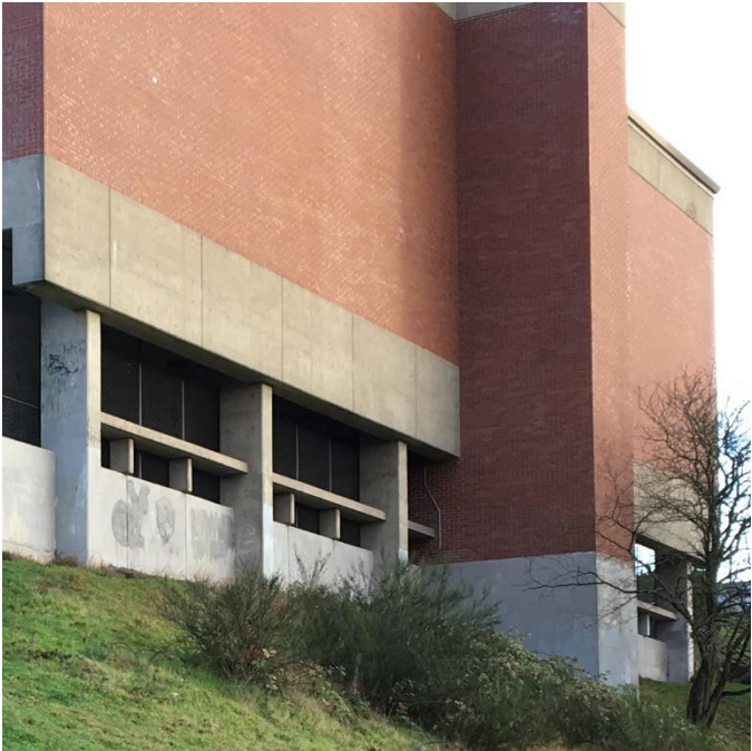
EXISTING CAST IN PLACE CONCRETE