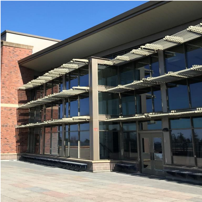
EXISTING SUN SHADE DEVICES