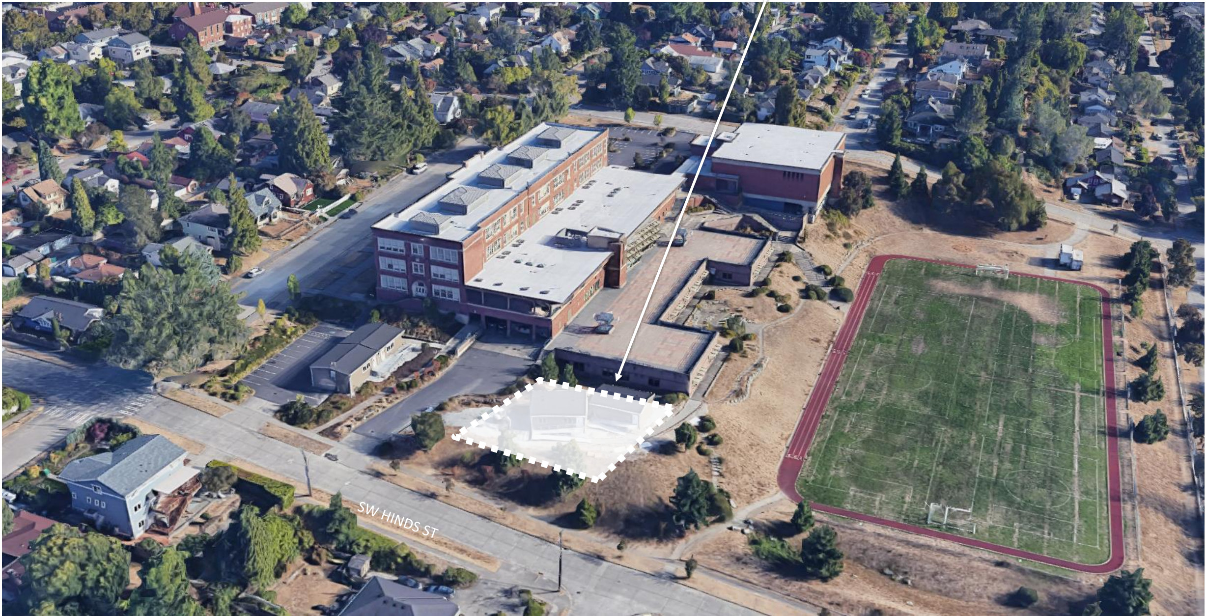
AERIAL VIEW LOOKING SOUTHEAST

PROPOSED SITE LOCATION ALONG SW HINDS ST FRONTAGE