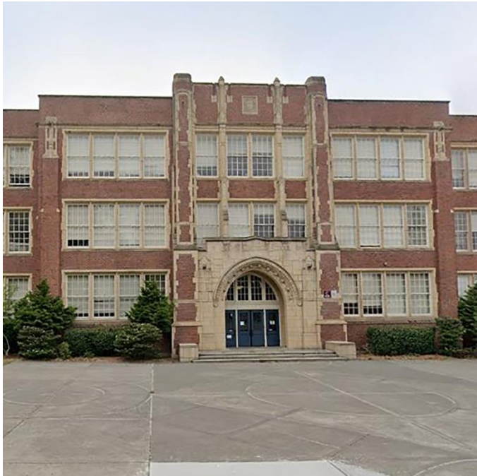
EXISTING STONE DETAILING