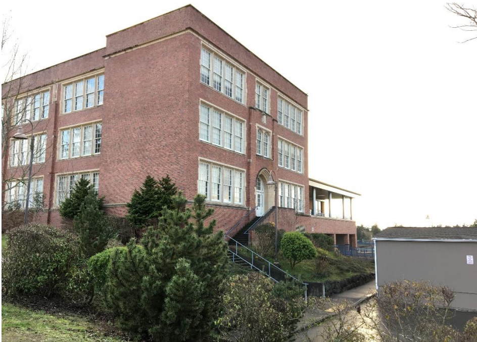
VIEW FROM 45 TH TOWARDS PROPOSED ADDITION LOCATION