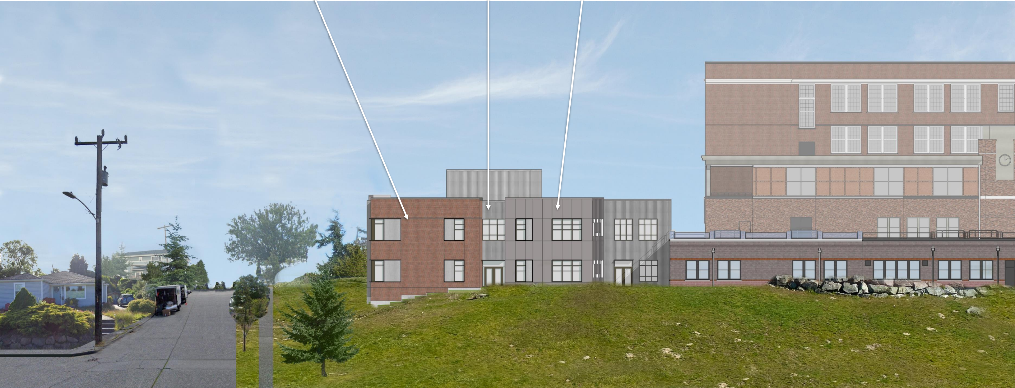
WEST ELEVATION FROM ATHLETIC FIELD – BRICK CORNER VOLUMES WITH VERTICAL METAL SIDING (PREFERRED OPTION)

METAL PANEL TO COMPLEMENT EXISTING METAL PANEL USAGE