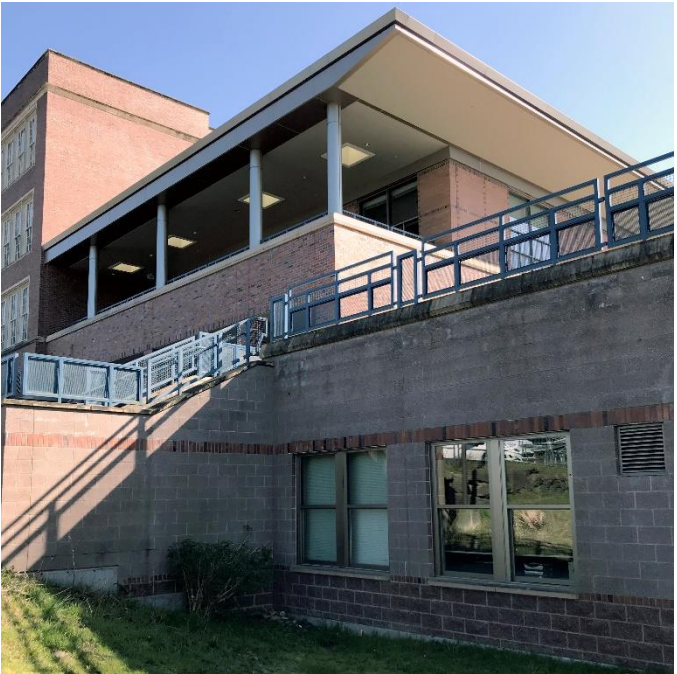
VIEW FROM NEW ADDITION LOOKING TOWARDS EXISTING ADDITIONS