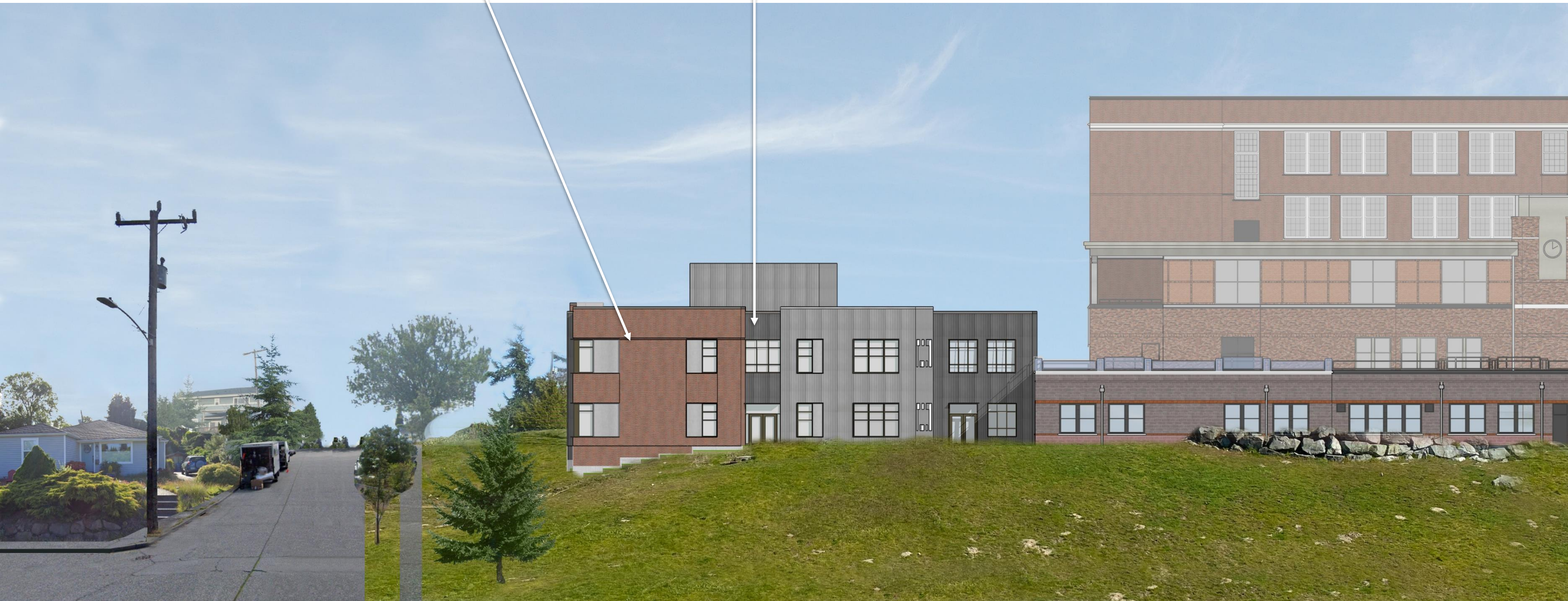
WEST ELEVATION FROM ATHLETIC FIELD – ALTERNATING BRICK AND VERTICAL METAL SIDING

PROPOSED ADDITION MATERIALITY SHOULD NOT COMPETE / CONTRAST WITH ORIGINAL