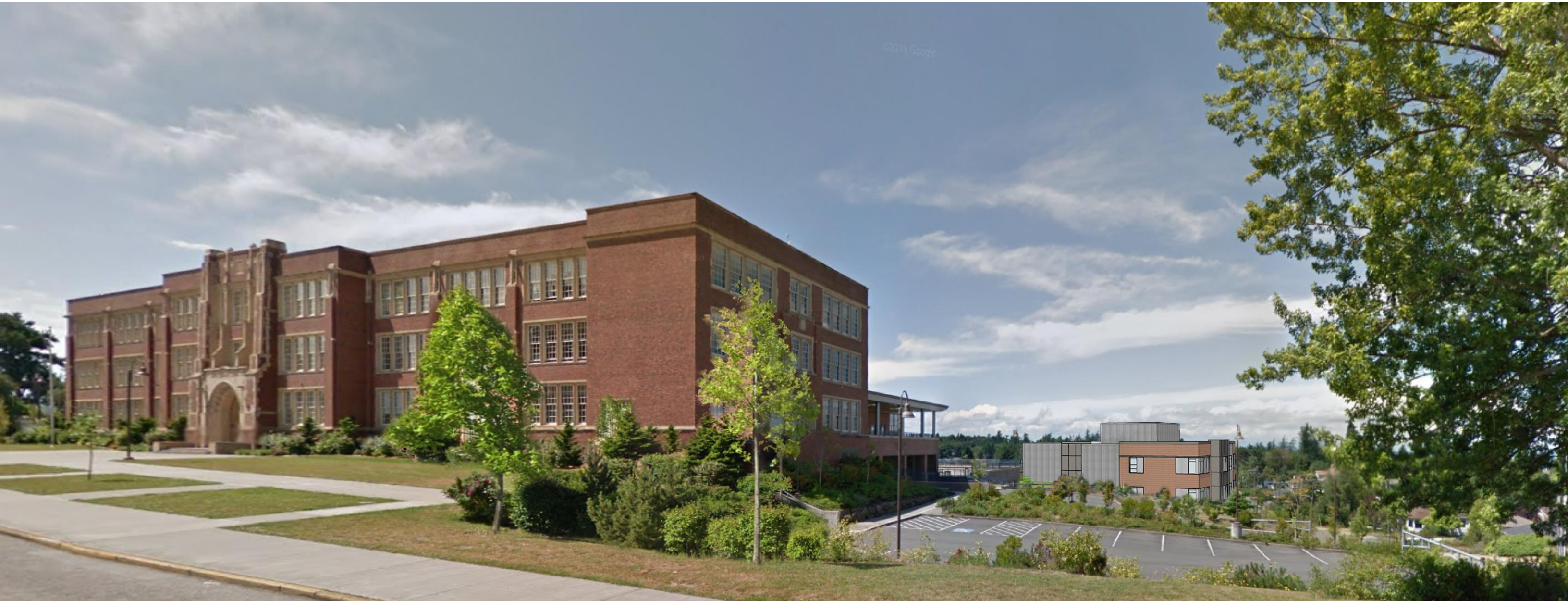
VIEW LOOKING WEST FROM ALONG 45TH AVE SW – METAL RUNNING BOND