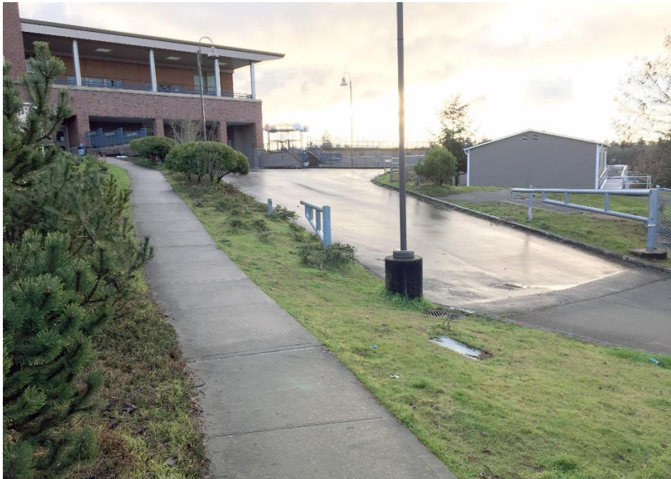
VIEW FROM LOADING DRIVE