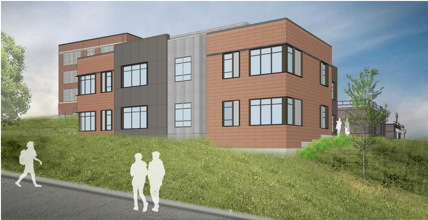
ALTERNATE PERSPECTIVE RENDERINGS PROM ALONG SW HINDS ST