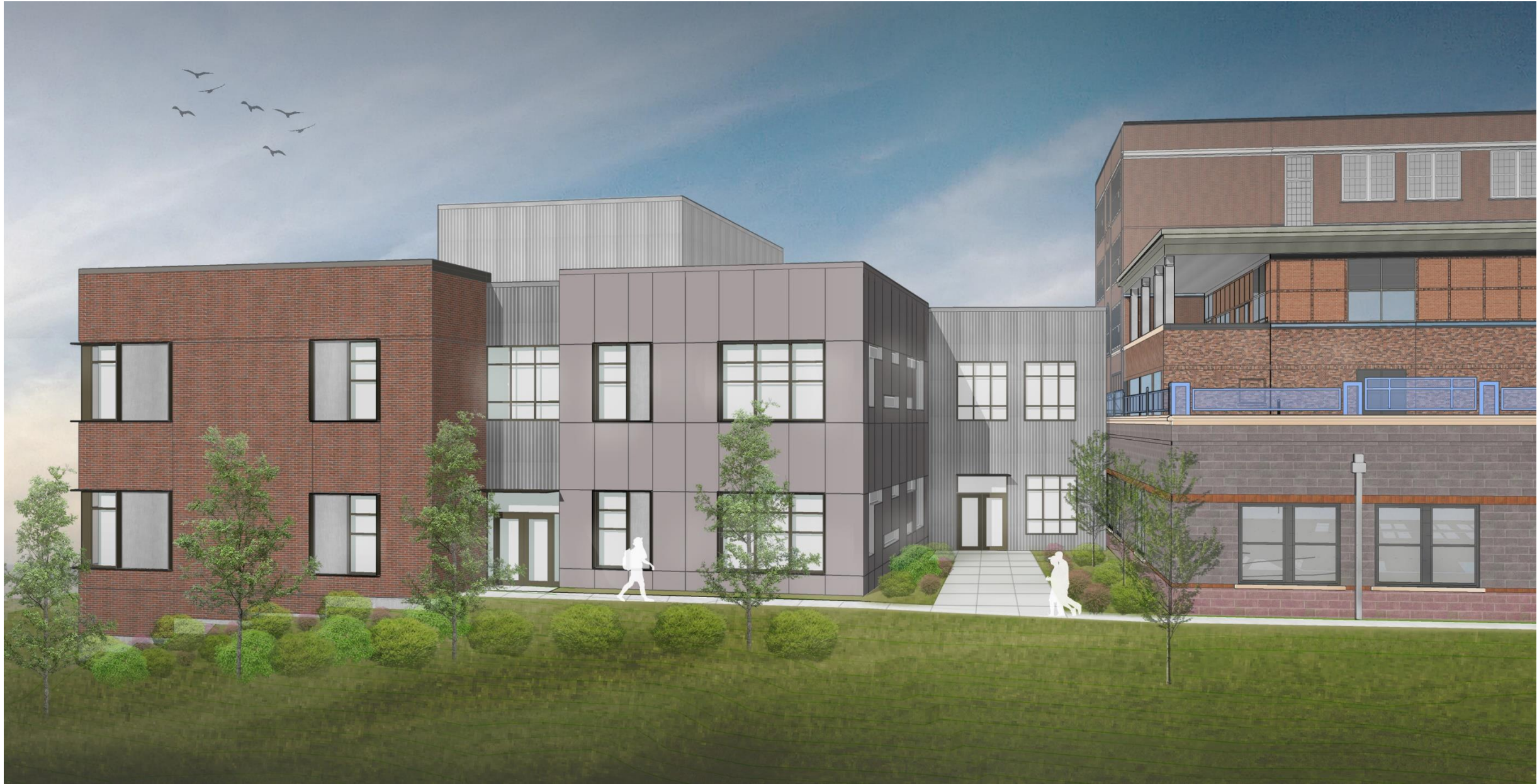
PERSPECTIVE RENDERING FROM ATHLETIC TRACK TOWARDS NEW ADDITION – BRICK CORNER VOLUMES WITH VERTICAL METAL SIDING (PREFERRED OPTION)