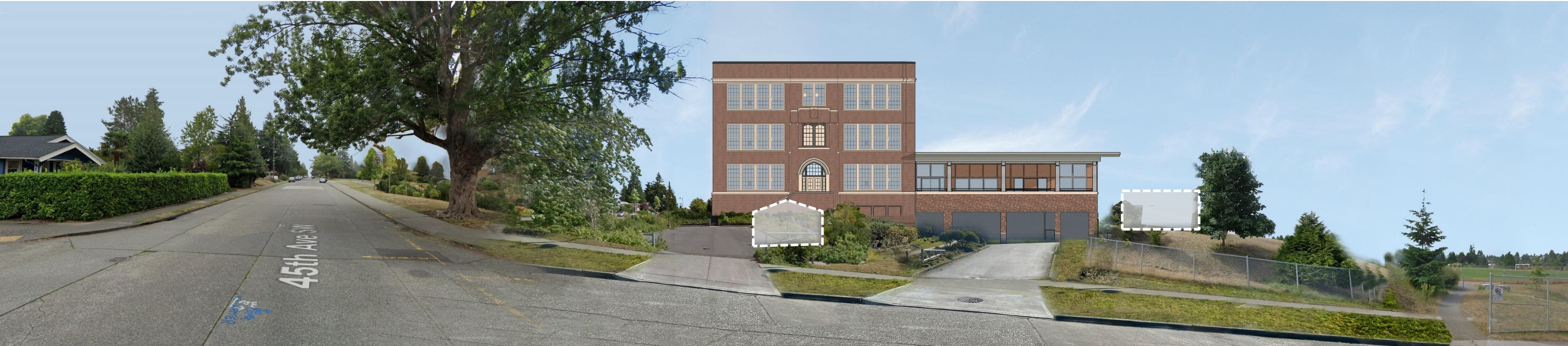
EXISTING NORTH ELEVATION ALONG SW HINDS ST