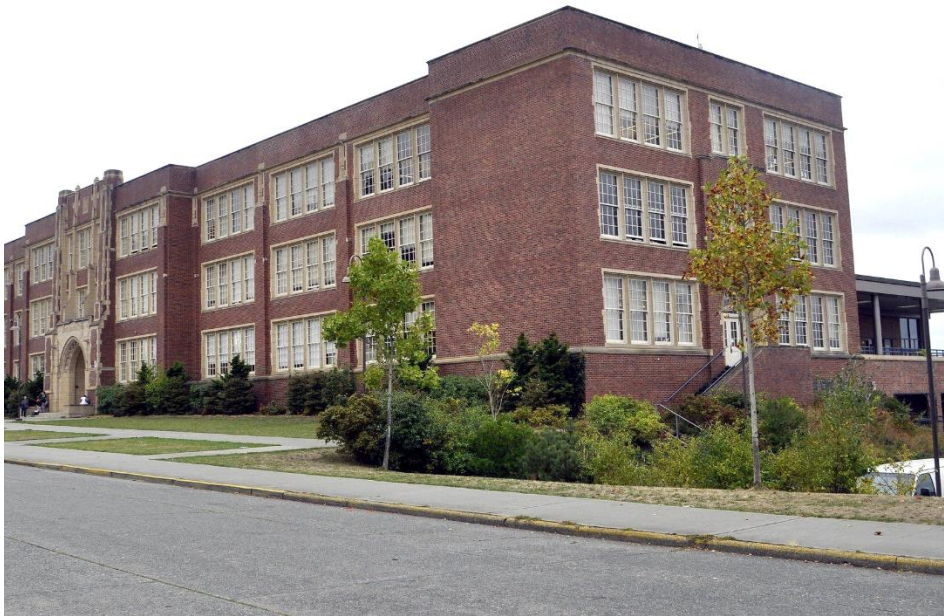
VIEW FROM 45 TH AVE SW