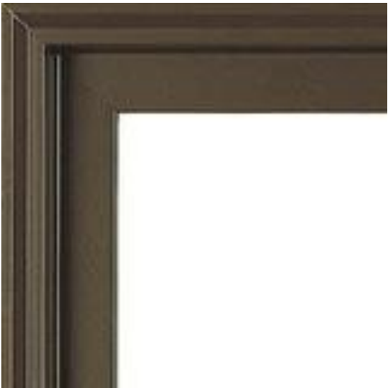
PROPOSED FIBERGLASS WINDOWS