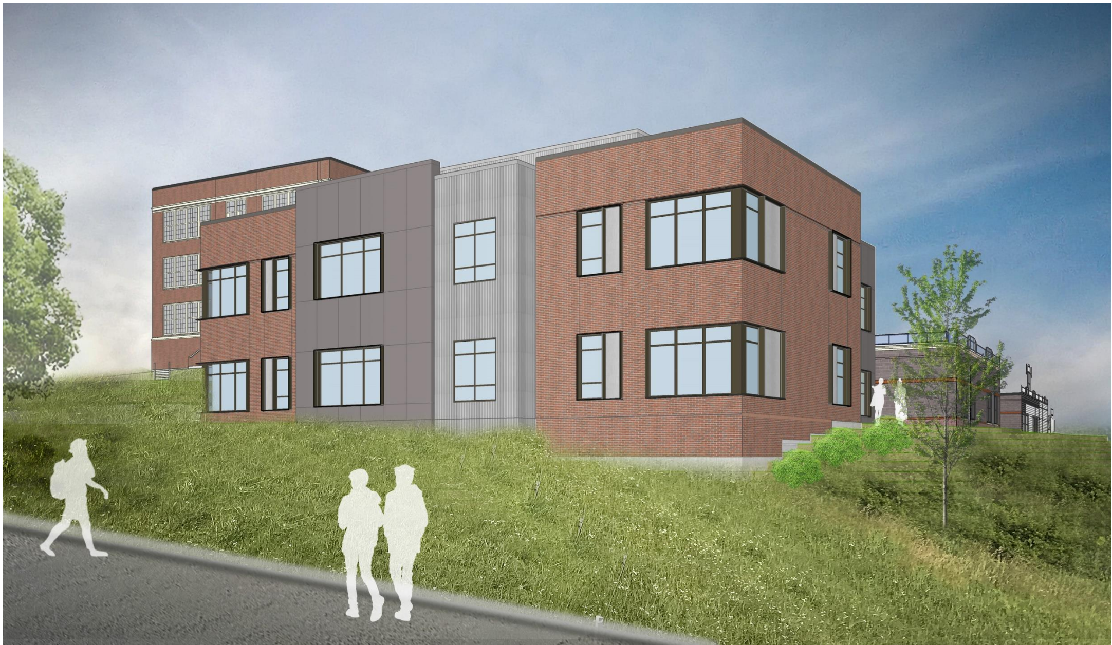
PERSPECTIVE RENDERING PROM ALONG SW HINDS ST – BRICK CORNER VOLUMES WITH VERTICAL METAL SIDING (PREFERRED OPTION)