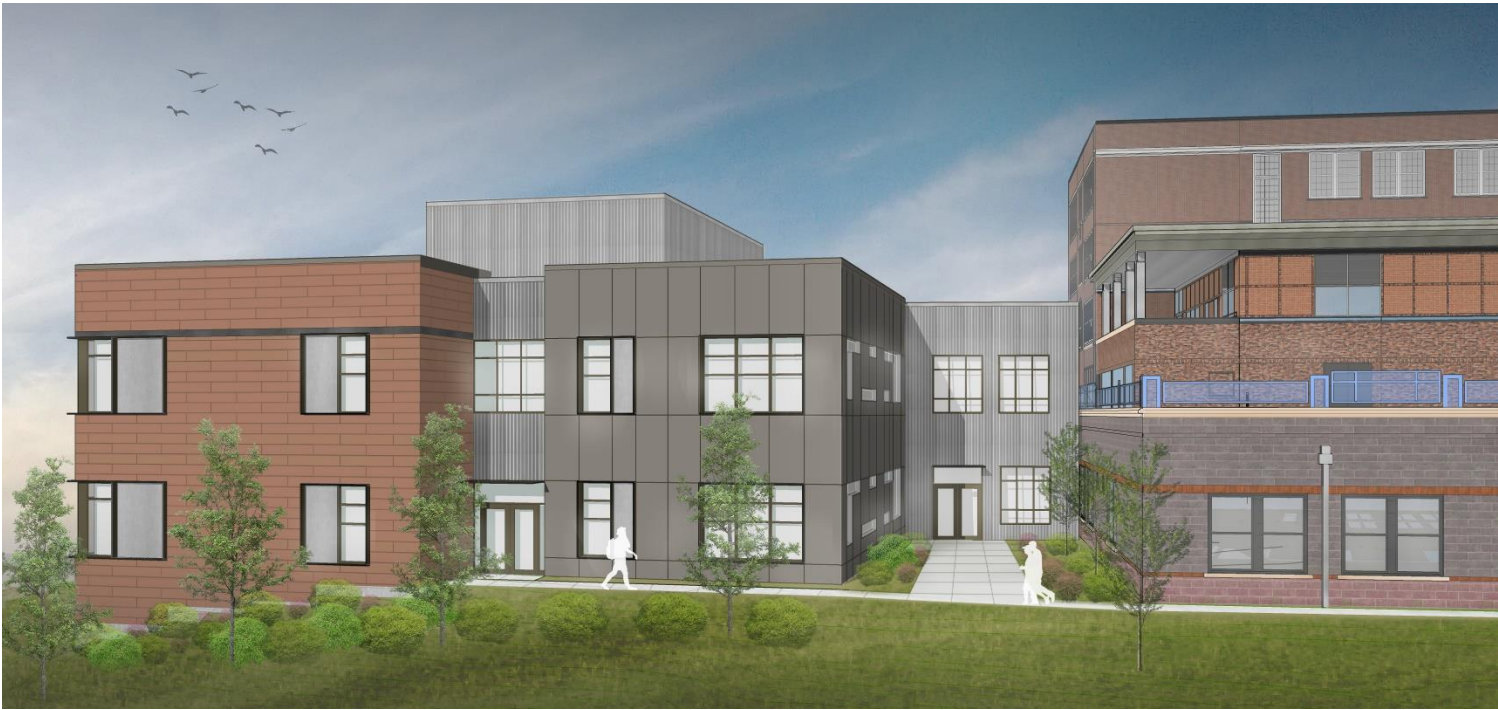
ALTERNATE PERSPECTIVE RENDERINGS FROM ATHLETIC TRACK TOWARDS NEW ADDITION