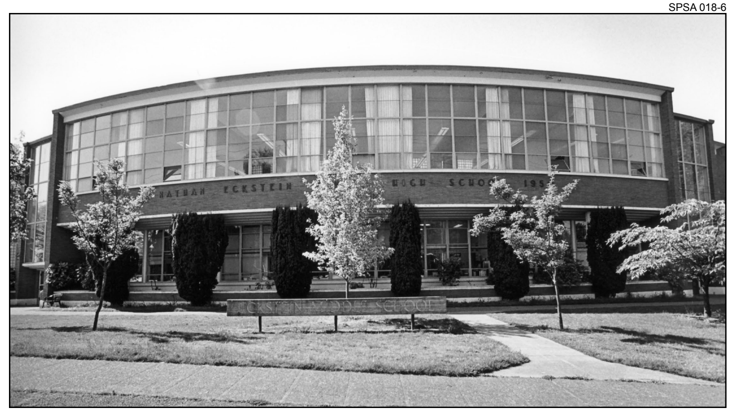
Figure 19. Eckstein Junior High (1950, William Mallis, City of Seattle Landmark)