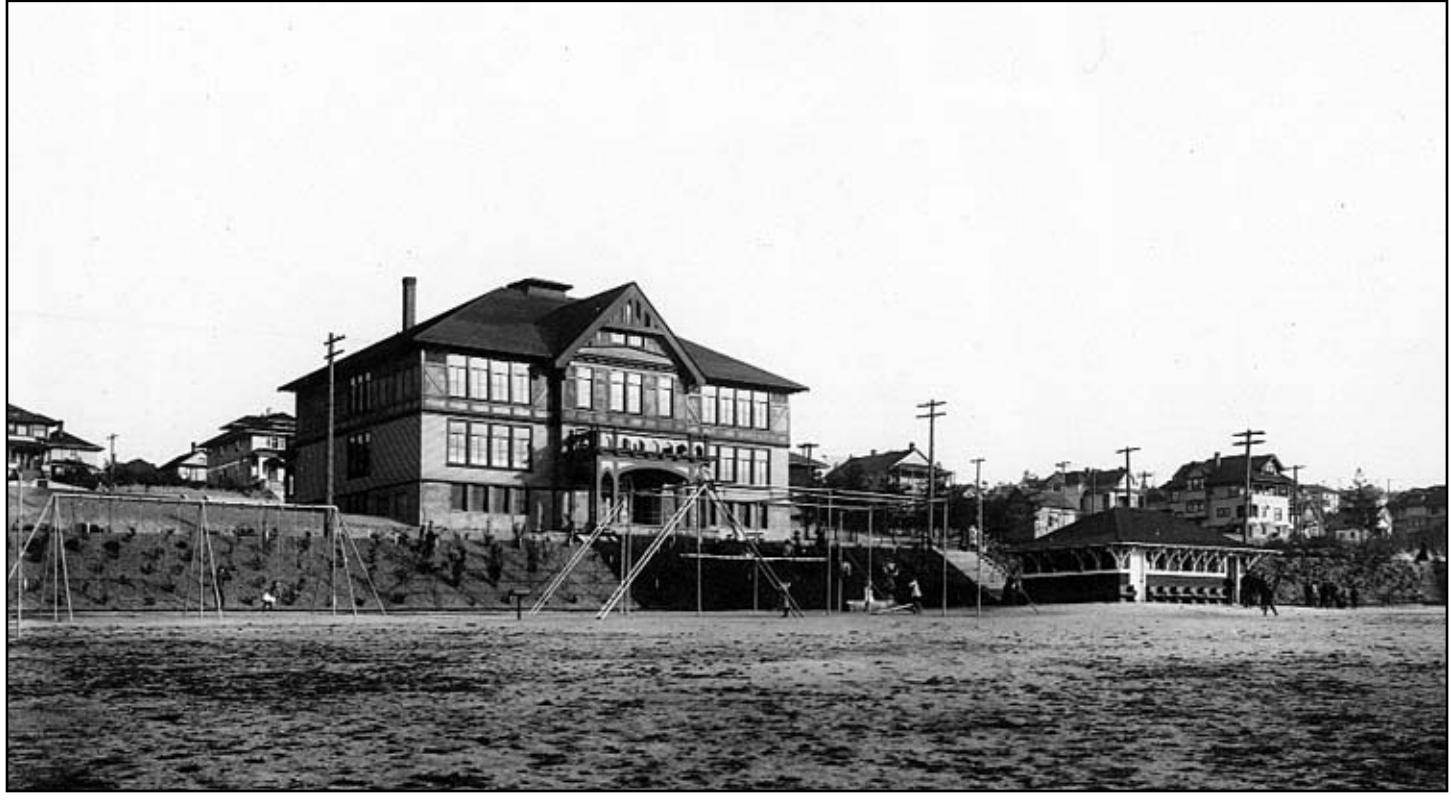
Figure 11. Seward School (Edgar Blair, 1917)