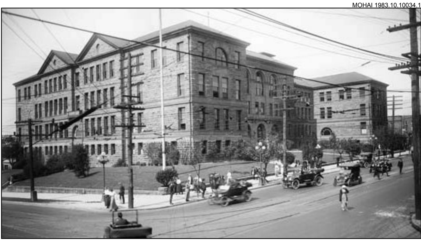
Figure 6. Central High School/Broadway High School (W.E. Boone & J.M. Corner, 1902)