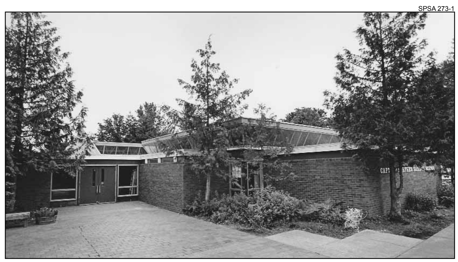
Figure 20. Captain Steven E. Sanislo School (Sullam, Smith & Associates, 1970)