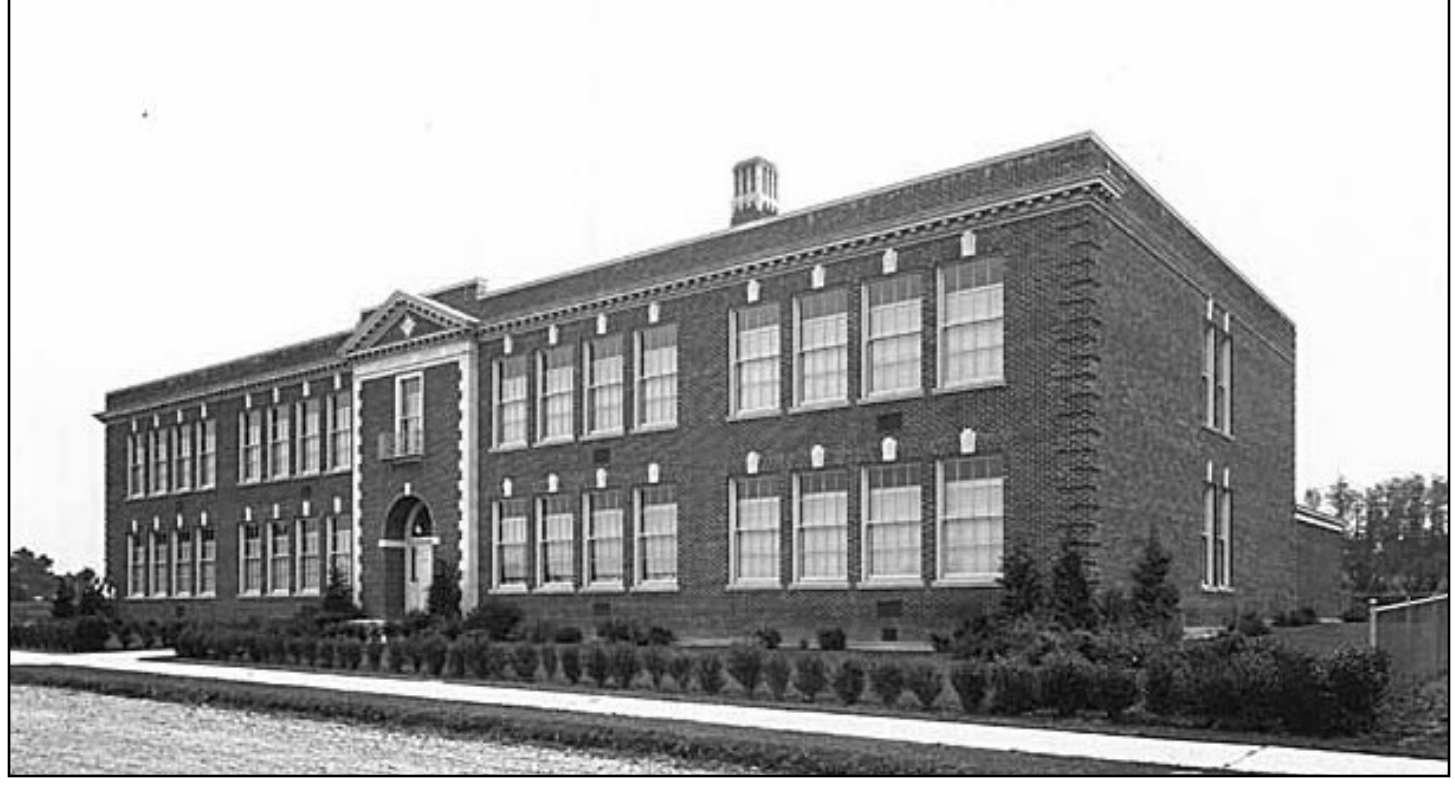
Figure 13. Laurelhurst School (Floyd A. Naramore, 1928)