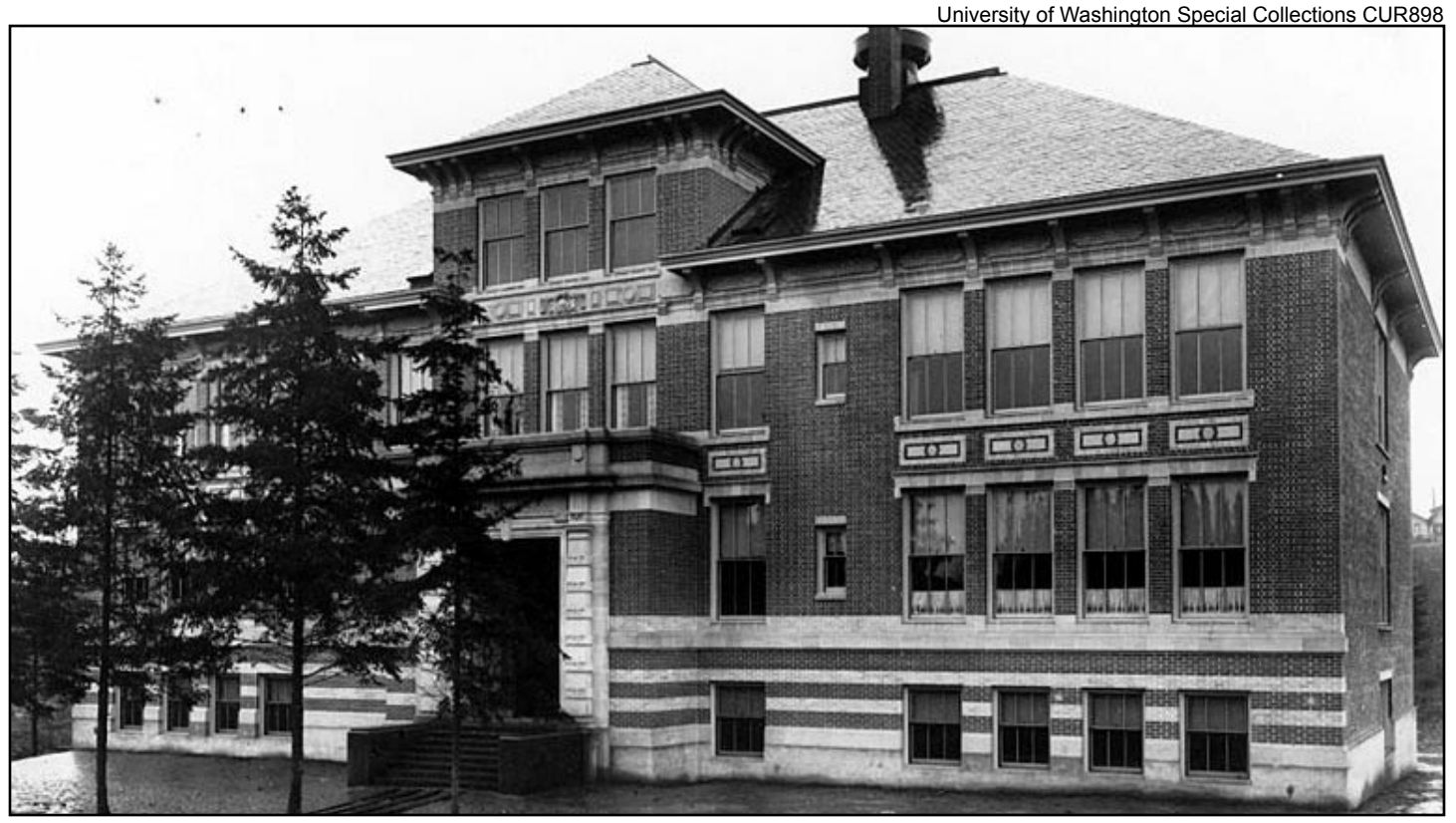
Figure 9. Ravenna School (Edgar Blair, 1911)