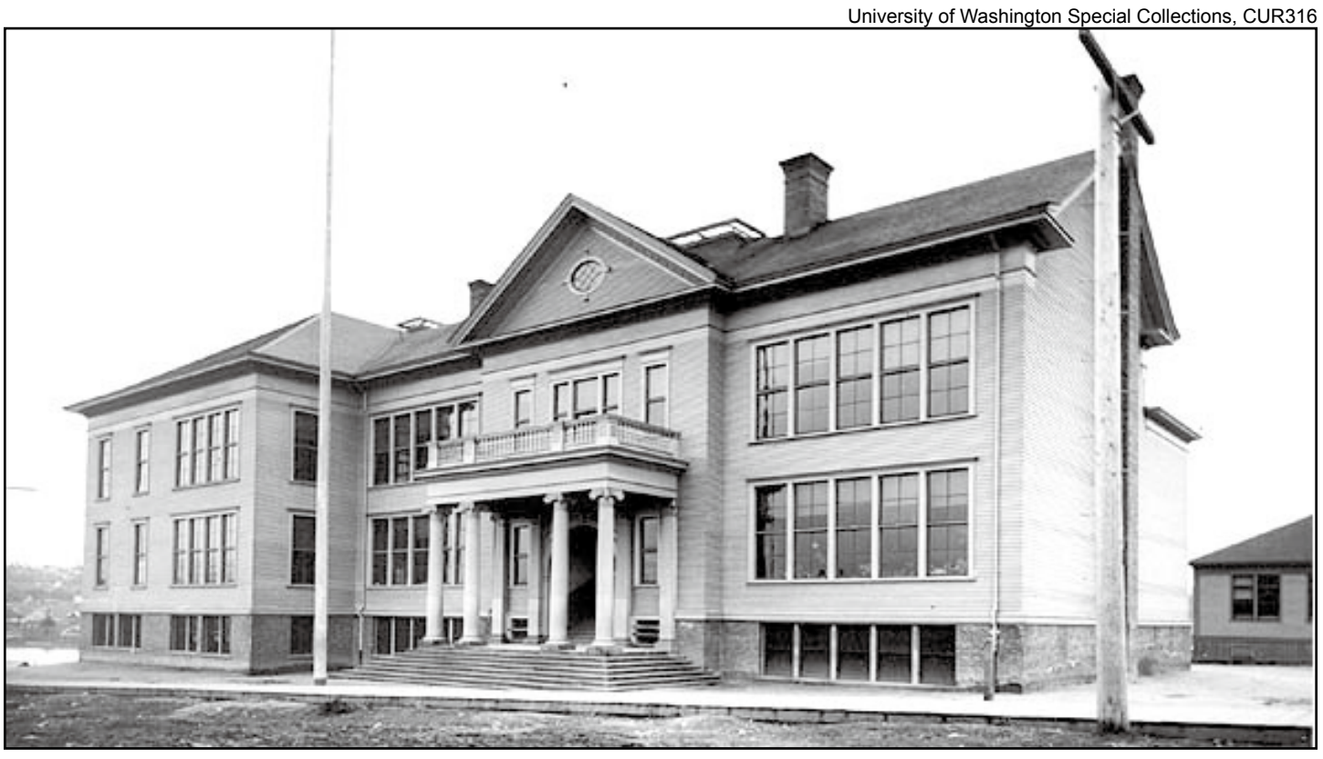
Figure 4. Green Lake School, 1902 (James Stephen, 1902)