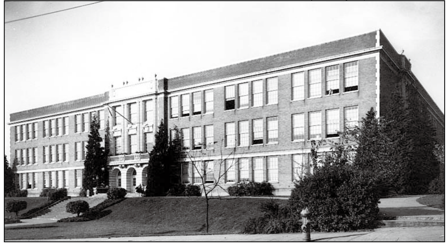
Figure 15. Roosevelt High School (Floyd A. Naramore, 1922, City of Seattle Landmark)