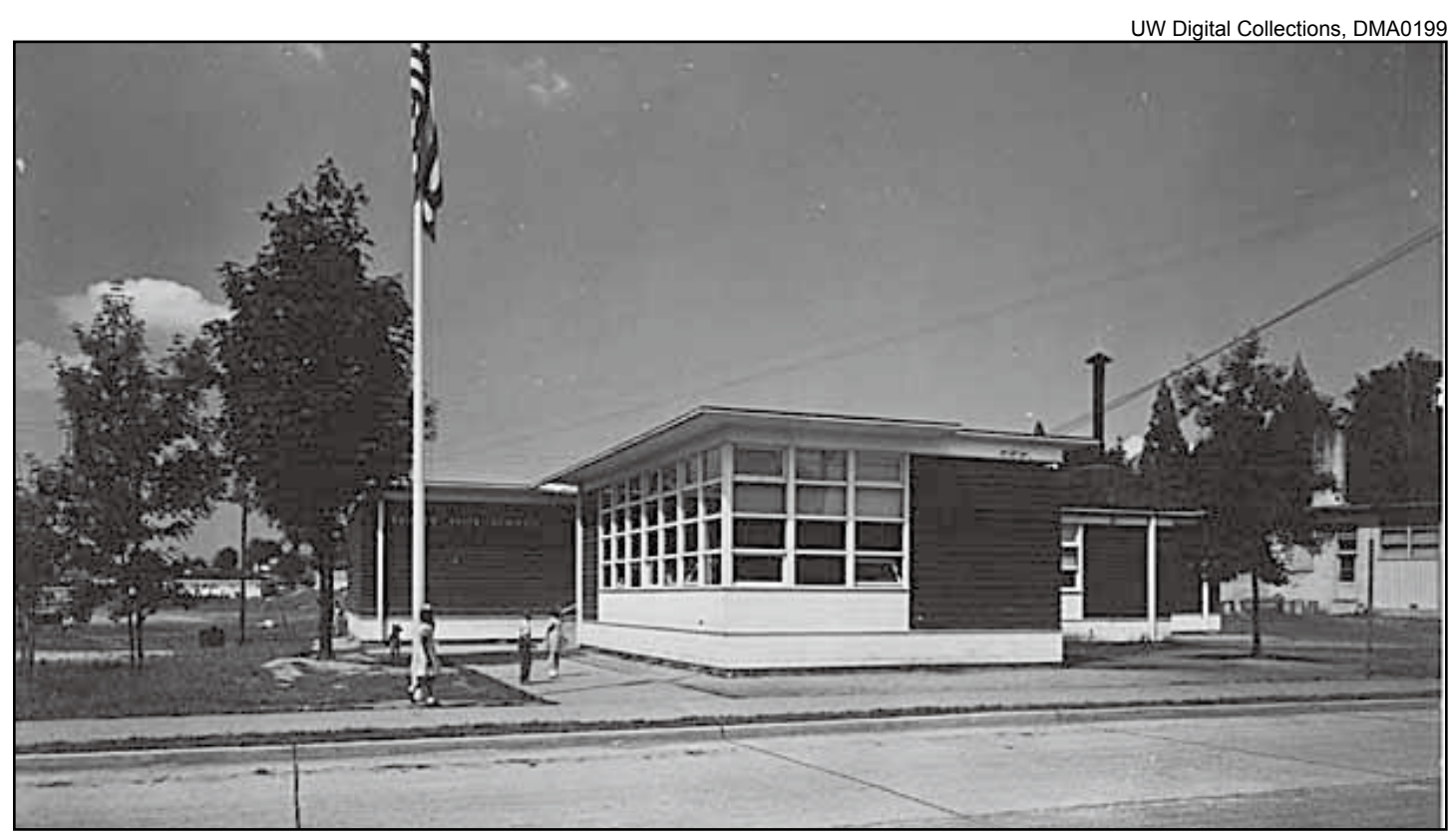
Figure 16. Rainier Vista School, Seattle (1943, J. Lister Holmes)