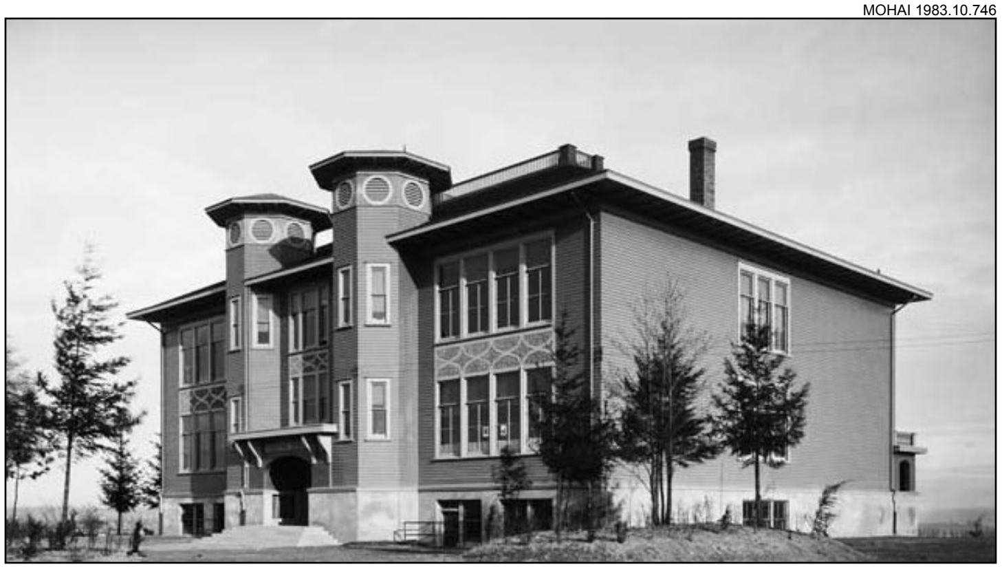
Figure 5. John B. Hay School (James Stephen, 1905, City of Seattle Landmark)