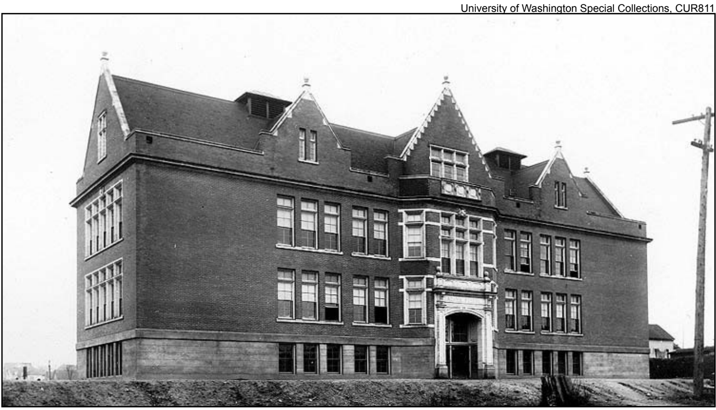
Figure 7. Adams School (James Stephen, 1901)