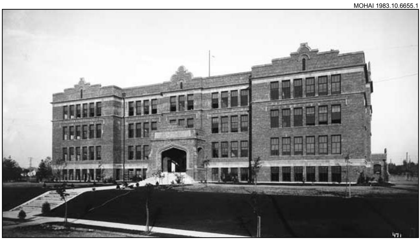
Figure 8. Lincoln High School (James Stephen, 1907)