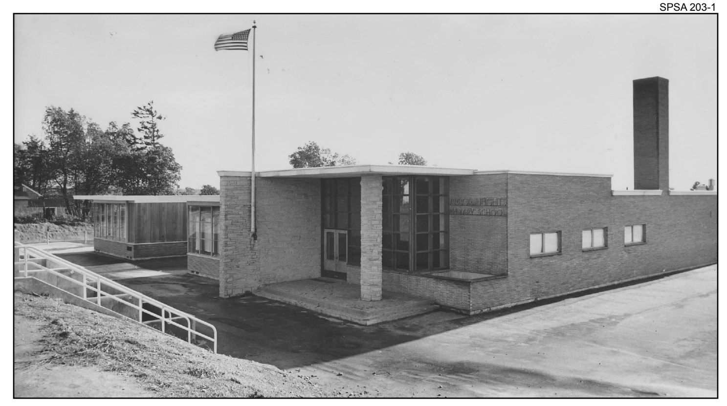
Figure 17. Arbor Heights Elementary (George W. Stoddard, 1949)