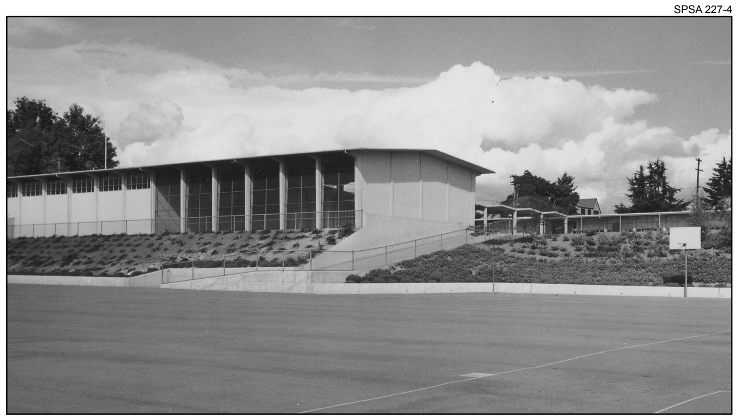
Figure 18. Cedar Park Elementary (1959, Paul Thiry, City of Seattle Landmark)