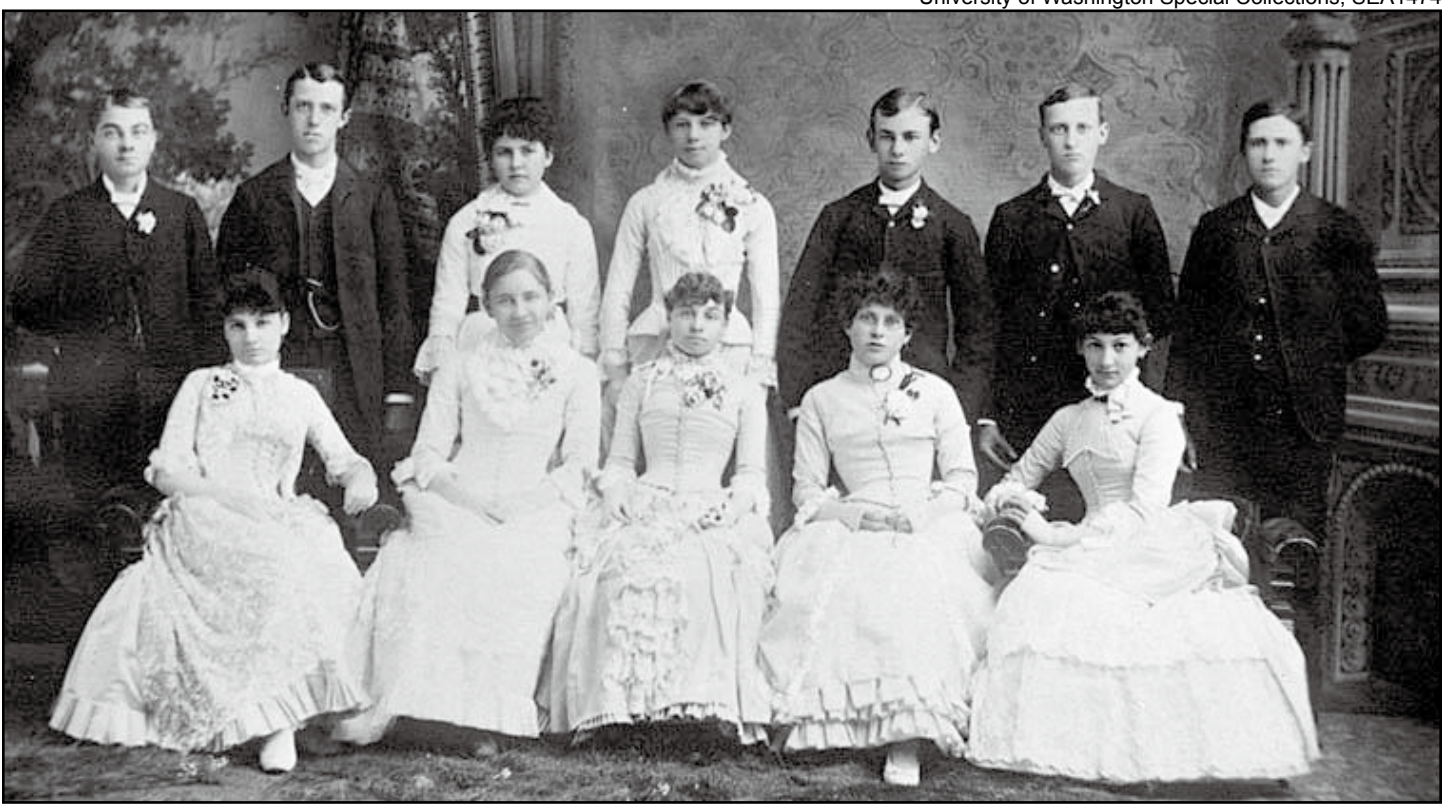
Figure 2. Seattle High School graduating class, June 4th, 1886

University of Washington Special Collections, SEA1474