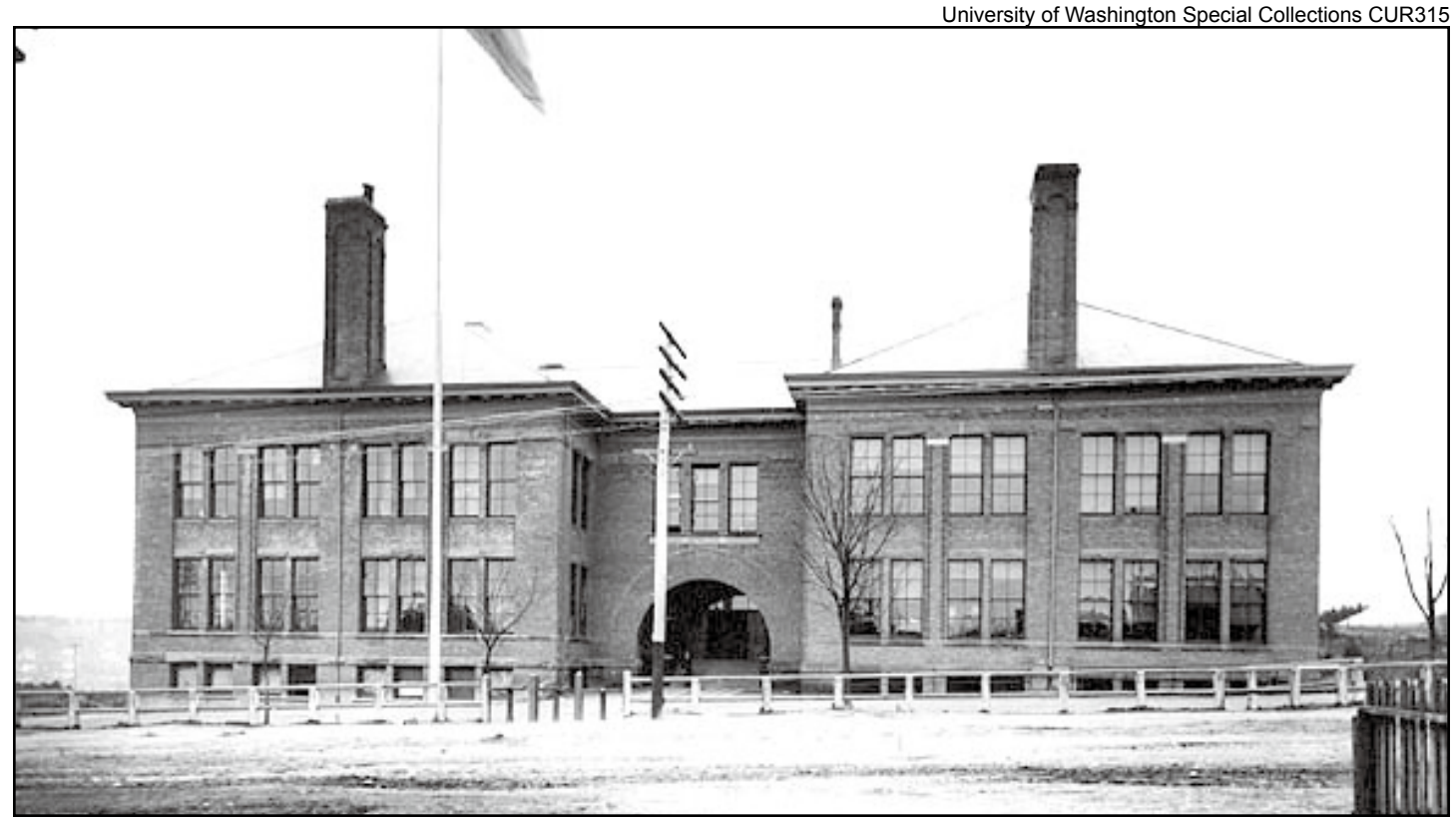
Figure 3. B.F. Day School (John Parkinson, 1892)