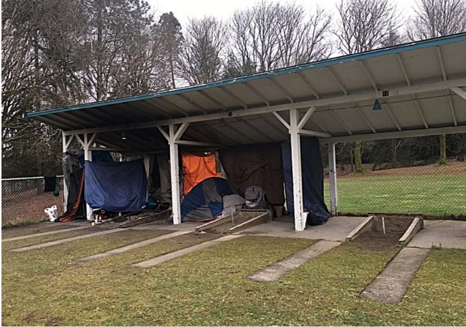
Exhibit A: Site Inspection