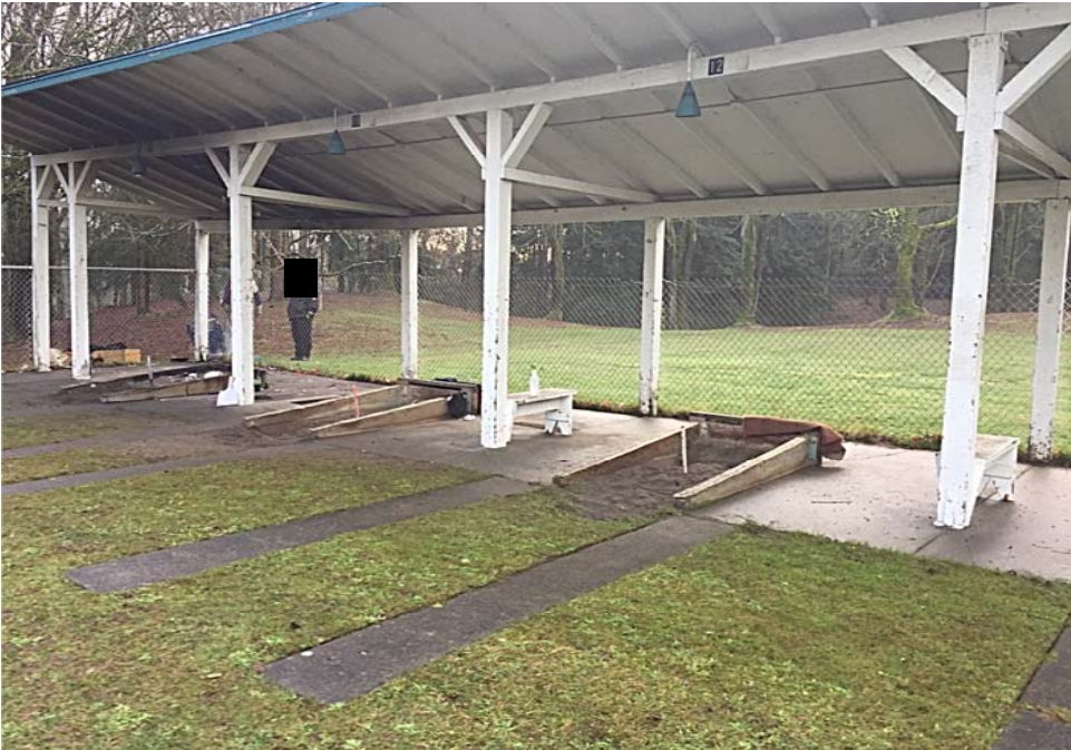
Exhibit D: Site Clean up