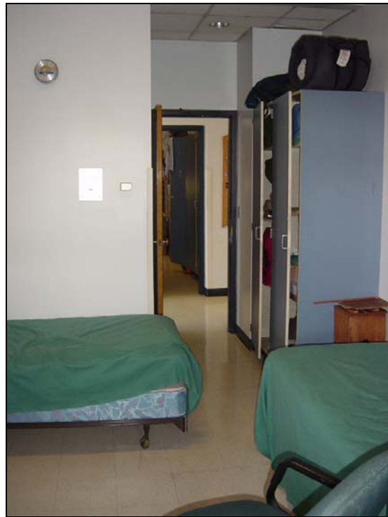
Above left, view of the Officer's Room looking north. Above right, view of the Medic Room looking north.