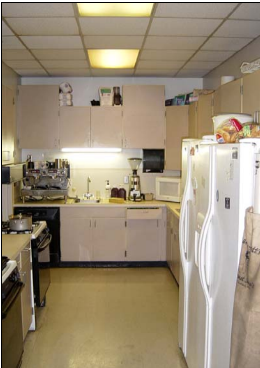
Below left, view of the Kitchen, looking west. Below right, view of hall outside the Beanery, looking south.