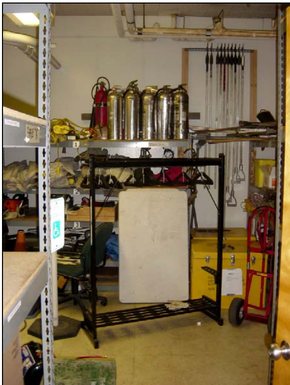
Below, view of the Storage Room.