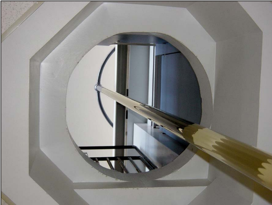
Below, view up a fire pole to the Second Floor.