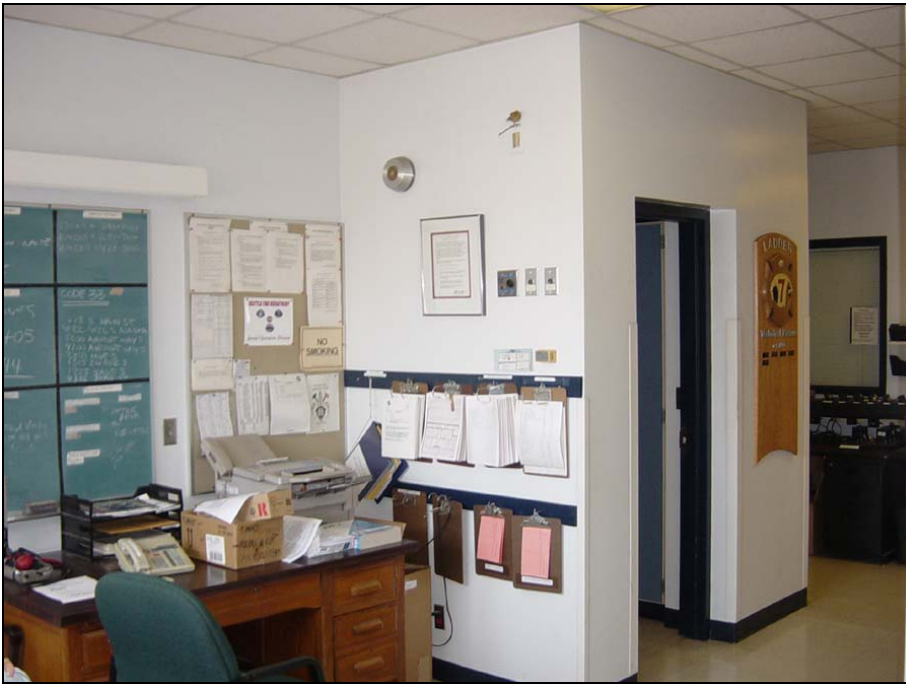
Above, view of the Watch Office, looking northeast.

Below, view from the Watch Office looking east through the hallway to the Officer's Rooms, Lounge (Bullpen), and Beanery at the far end of the hall.