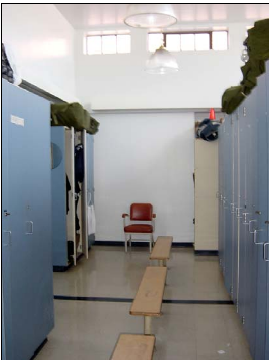
Below left, view of Locker Room looking south. Below right, view of Locker Room with clerestory windows above at left.