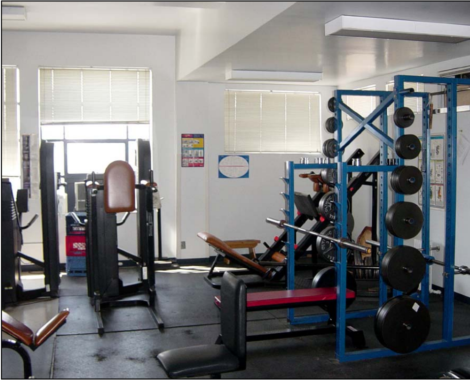
Above, view of the Second Floor Exercise Room looking south.