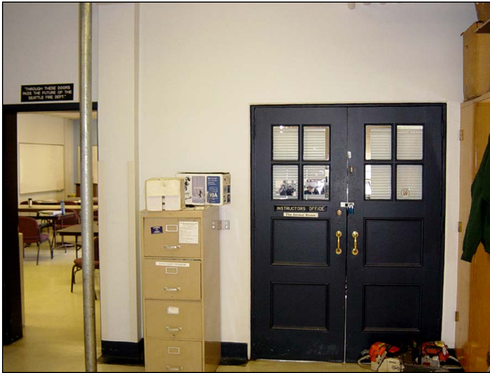
Above, view of the lobby of the Training Center on the First Floor. The doors are original.