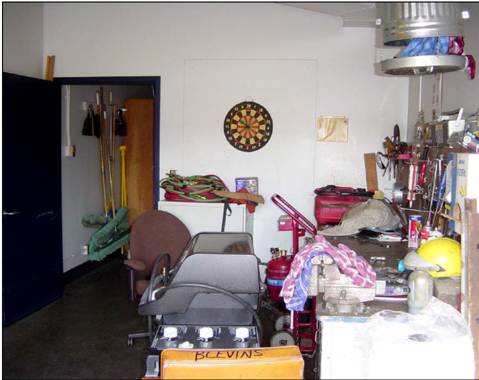
Above, view of the Hose Tower Access and Workshop area looking west.