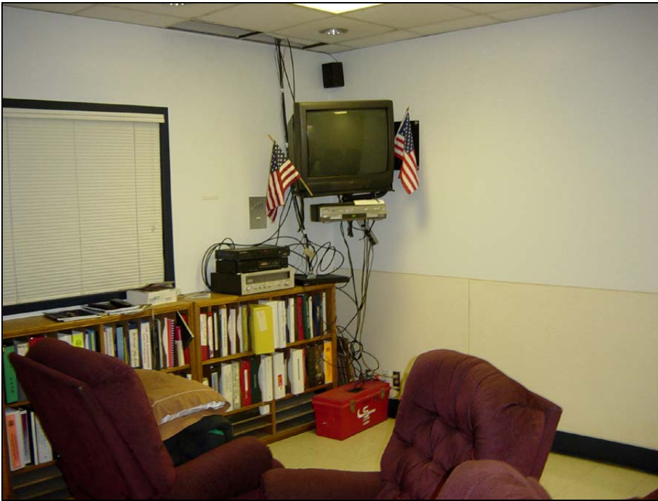
Above, view of the Bullpen (Lounge) looking northwest.