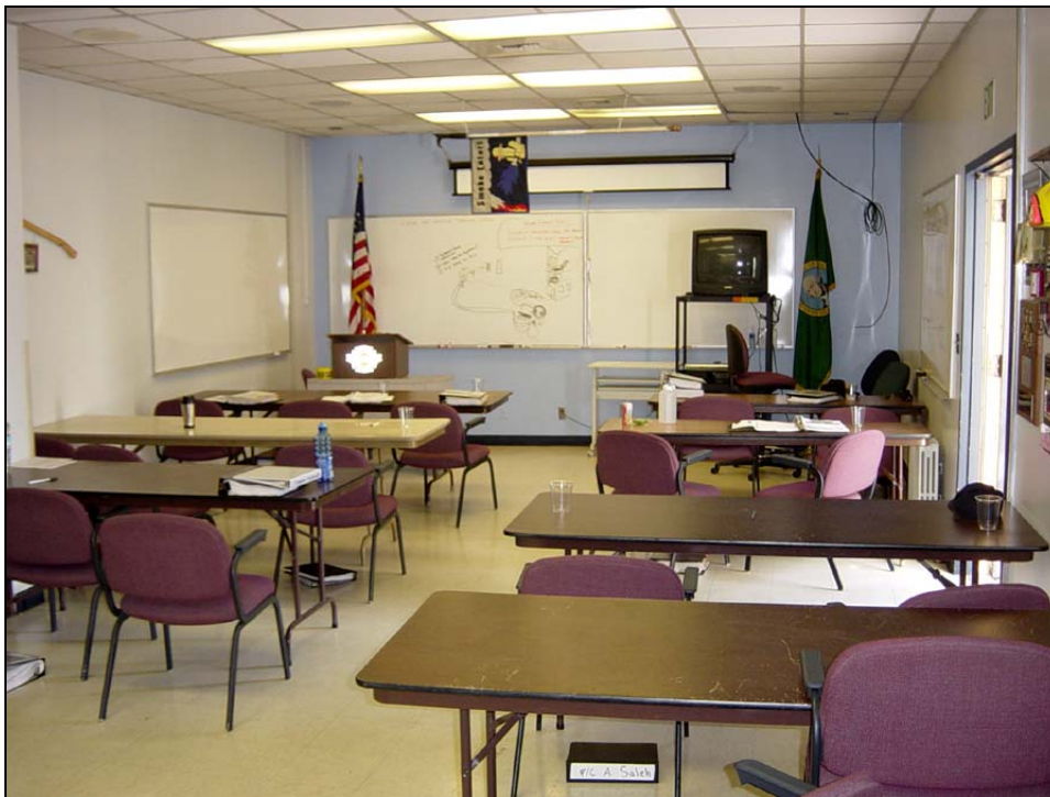
Below, view of the Training Center Classroom at the northeast corner of the First Floor, looking east. This space was remodeled in 1965, with a classroom replacing the original Handball Court.