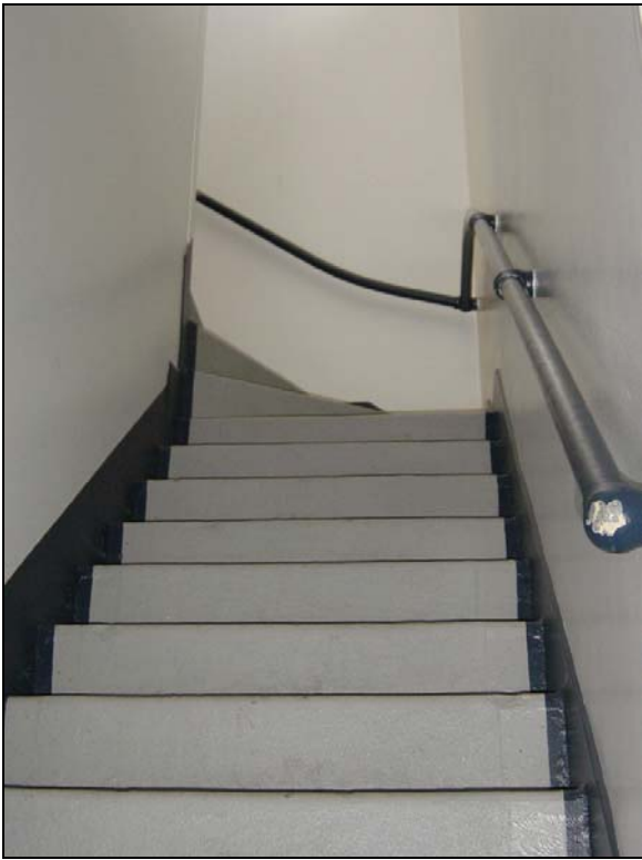
Above, detail of the concrete stair to the Second Floor.