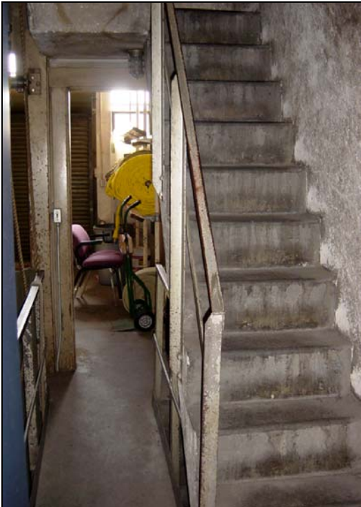
Below, view of stair leading to the bottom of the Hose Tower.