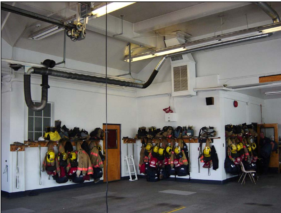
Below, view of the South Apparatus Room, looking northeast.