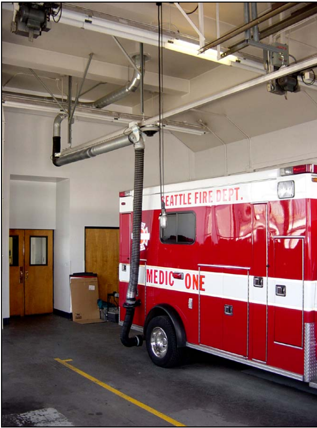
Above, view of the North Apparatus Room, looking southeast, with Medic One unit in place.

Below, view of the Watch Office, looking southwest. This room was originally the Battalion Chief's Garage, and was converted in 1986.