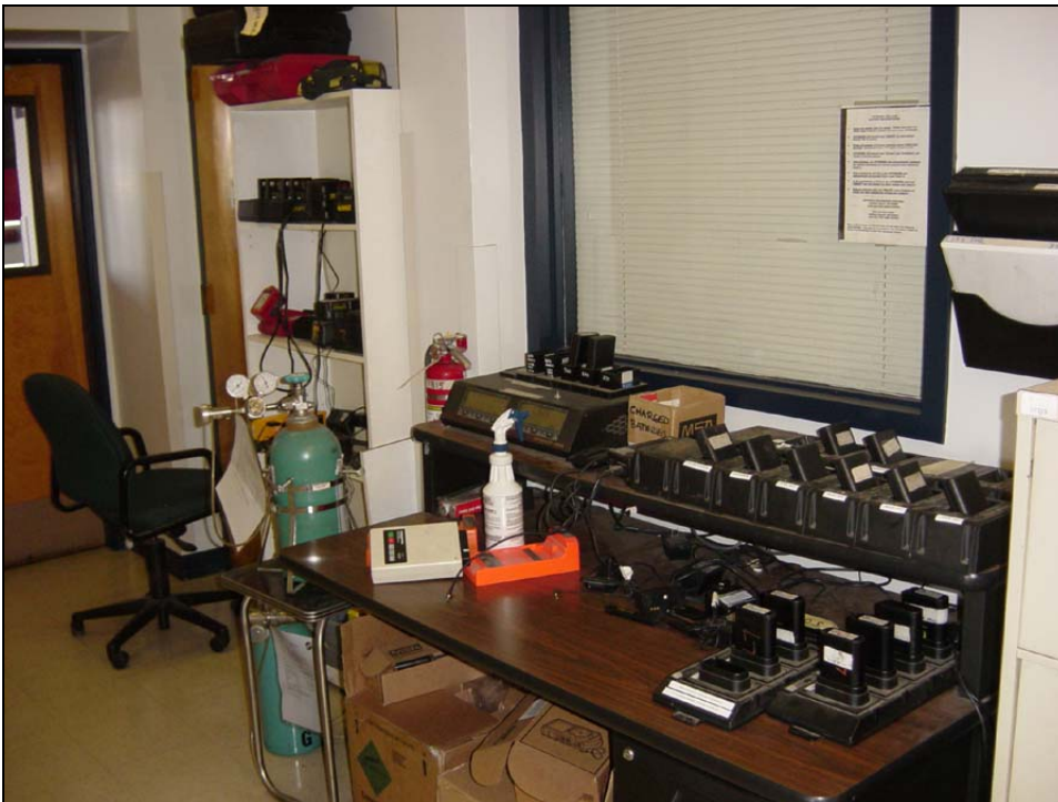
Below, view of the battery charging station in the hall west of the Bullpen.