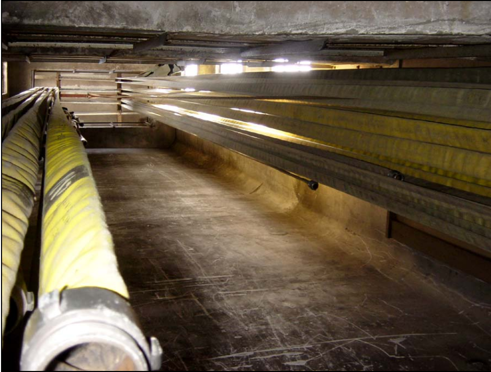
Above, view looking up the Hose Tower from Basement.