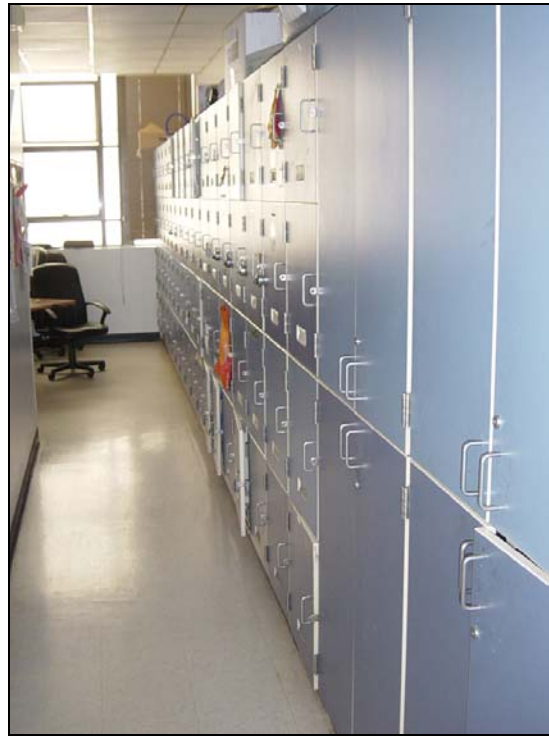
Above left, view of the dining area of Beanery, looking east. Above right, detail of the food lockers on south wall of the Beanery.