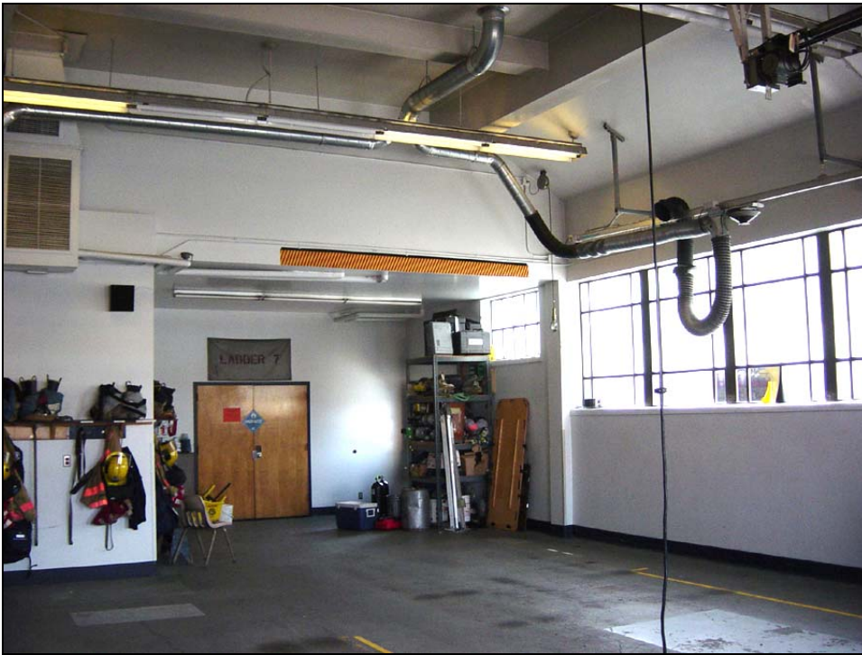
Above, view of the South Apparatus Room, looking southeast.