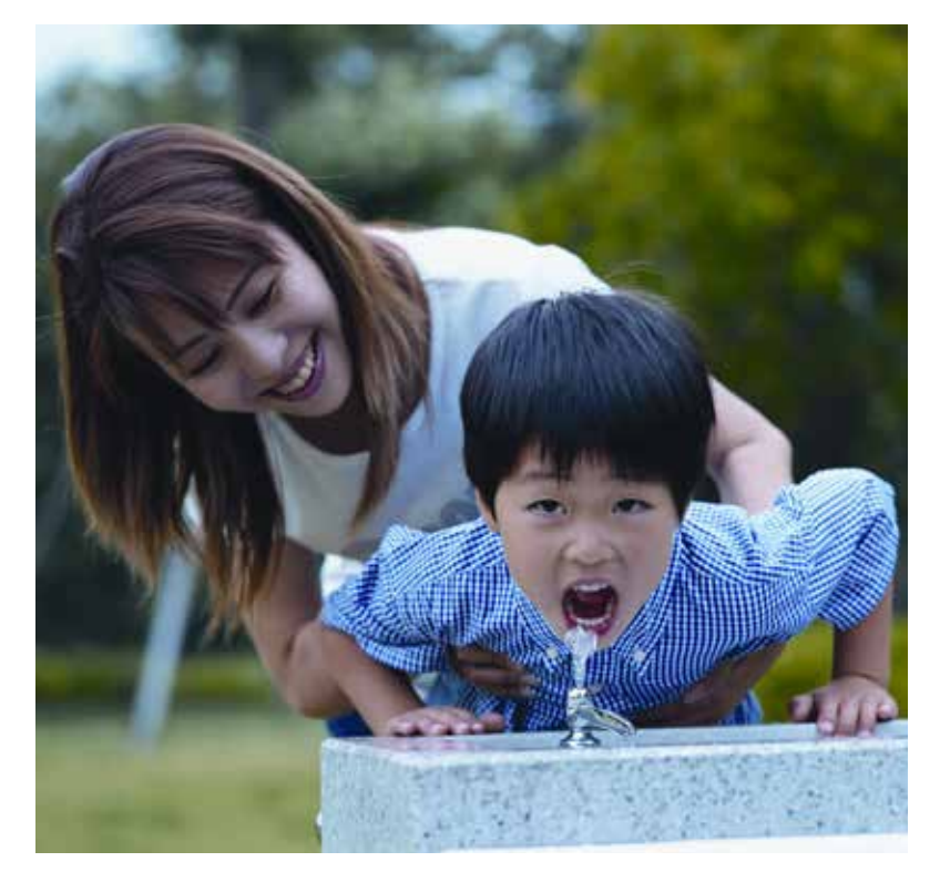
Seattle's fresh clear mountain water is some of the best source water in the world.