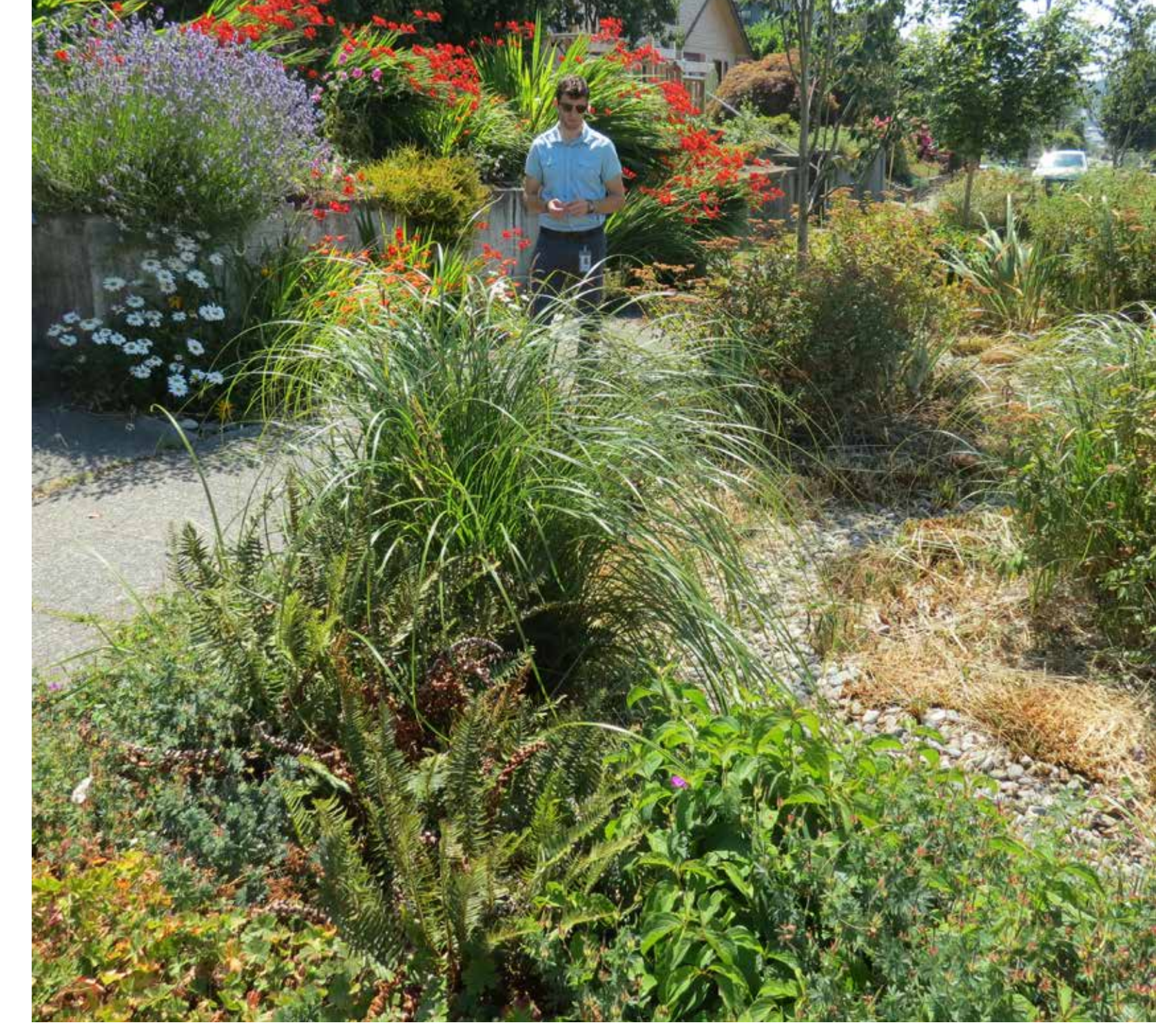
Rain gardens are one of many green infrastructure projects around Seattle.

We will adjust to unforeseen demands, practice environmental stewardship, and take advantage of opportunities today that will save money tomorrow.