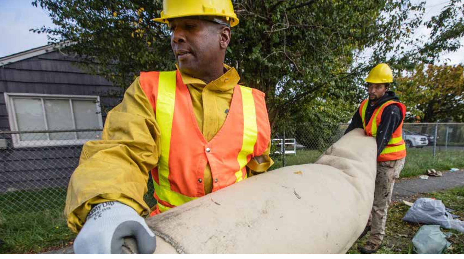
Every day our 1,400 employees deliver reliable services to your home or business.