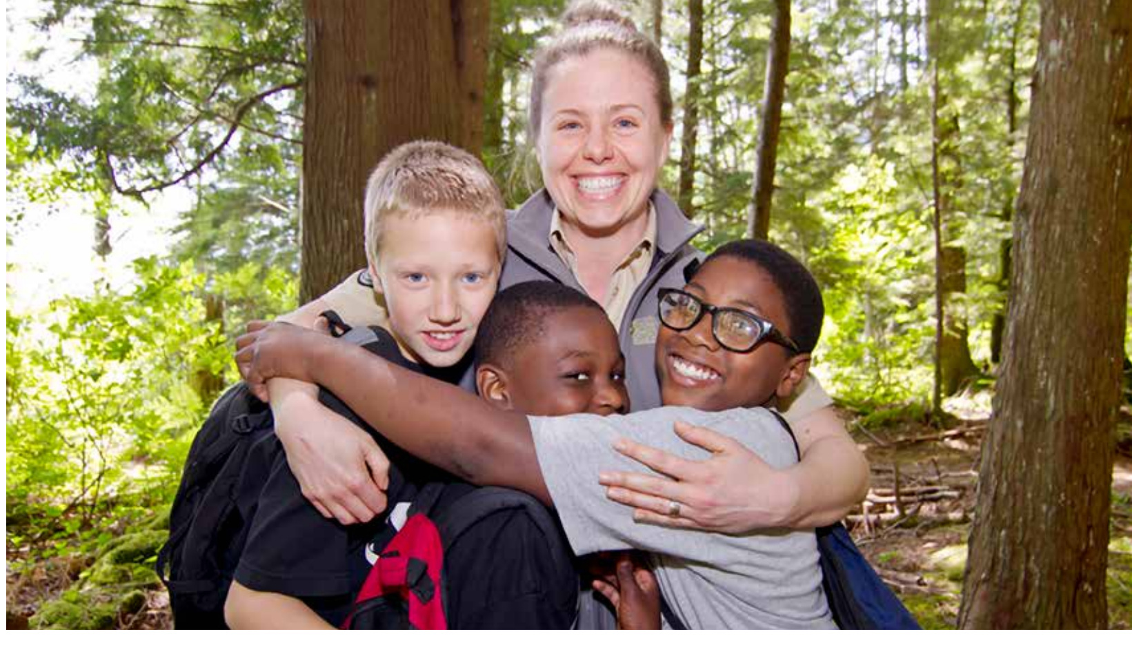
SPU's Cedar River Watershed Education Center offers a beautiful, family-friendly, interactive learning experience. Open daily Tuesday through Sunday, 10 a.m. to 4 p.m.

Everything we do is in the service of keeping our promise to our customers: