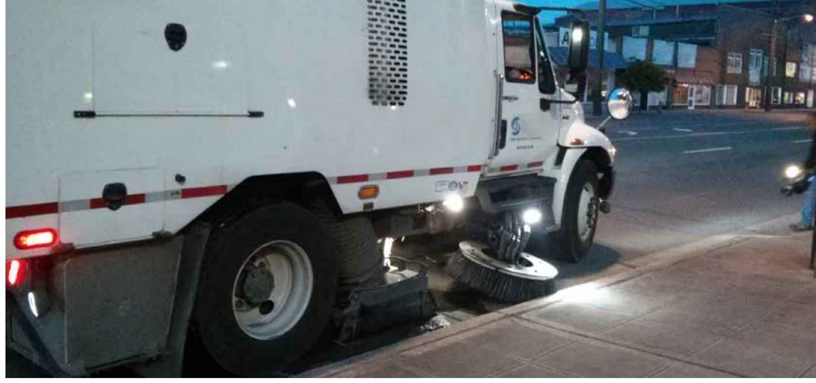
SPU cleans 20,000 miles of Seattle streets every year.