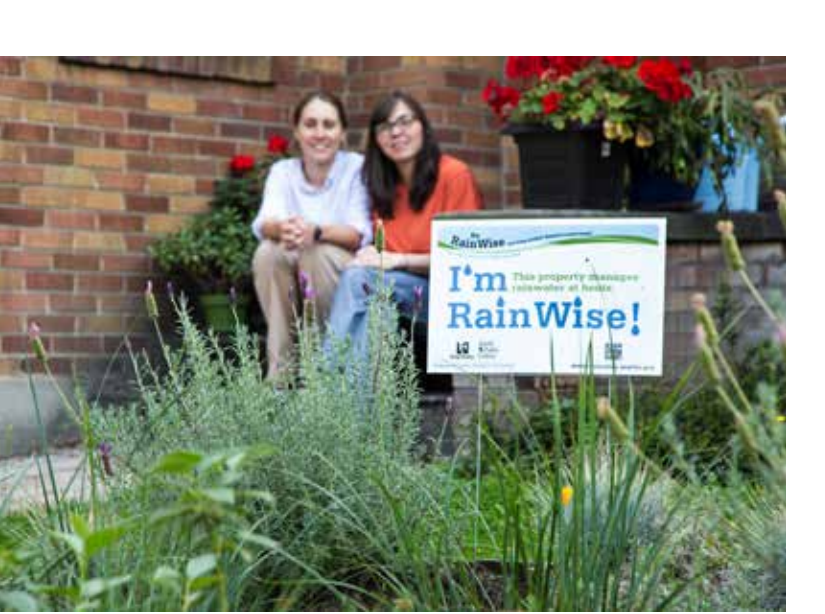
The Rain Wise program is just one of the ways we are reducing sewer backups and flooding