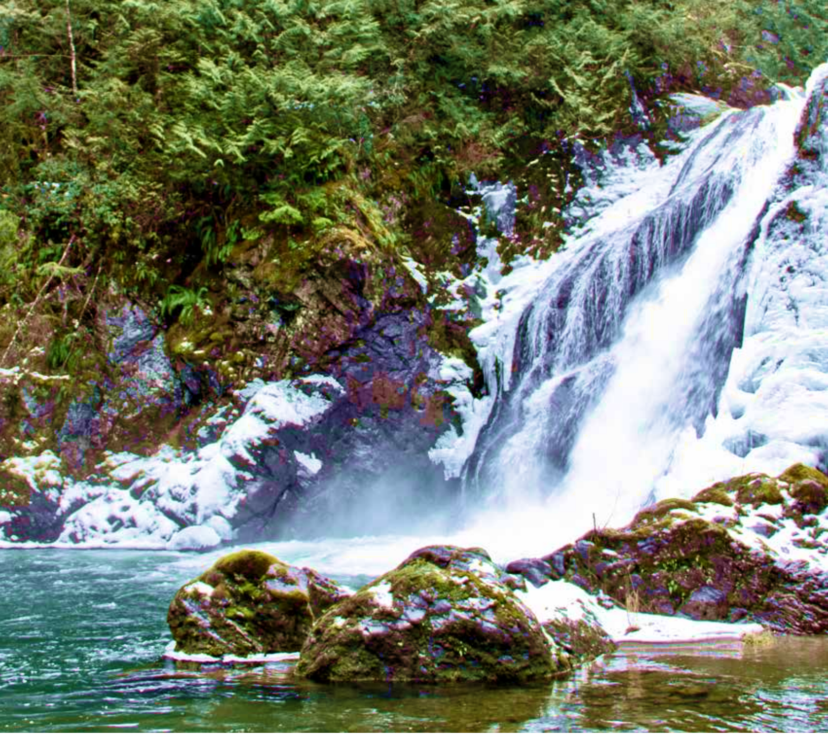
Cedar Falls in the Cedar River Watershed.