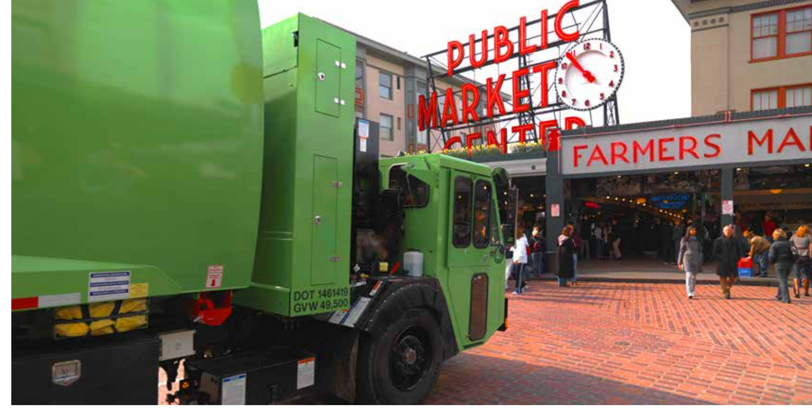
Collecting compostable organics at Seattle's Pike Place Market.