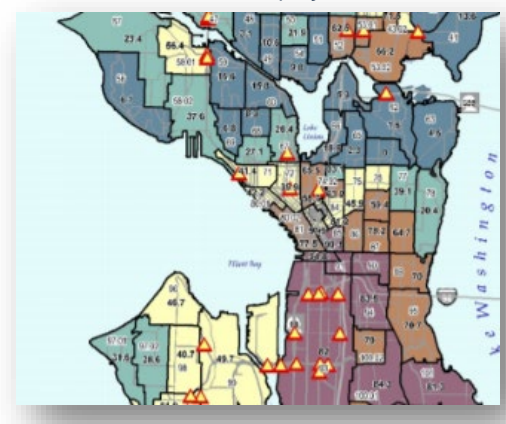
Detail from an OCA map showing SDOT LPR cameras locations and equity.

Surveillance Technology: As required by the Surveillance Technology Ordinance, we reviewed the Seattle Department of Transportation (SDOT) use of License Plate Readers (LPR) technology. We found that for about 10 years, SDOT has been sharing LPR data with the Washington State Department of Transportation (WSDOT) without a data sharing agreement. We recommended that an agreement be executed between SDOT and WSDOT that, at a minimum, addresses data sharing, retention, and deletion of LPR data, including what WSDOT can and cannot do with the LPR data outside of its agreement with SDOT. SDOT indicated that instead of pursuing an agreement with WSDOT, that they plan to completely phase out its use of LPR technology by the end of 2021.