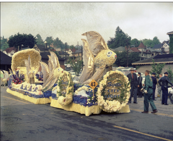
Seattle City Light Seafair Float, July 1956 Item 78684, Seattle City Light Photographic Negatives, Series 1204-01, Seattle Municipal Archives.