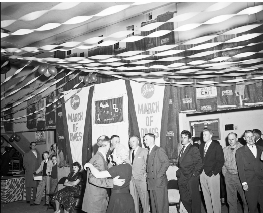
March of Dimes Dance in Newhalem, March 1954 Item 78356, City Light Photographic Negatives, Series 1204-01, Seattle Municipal Archives.