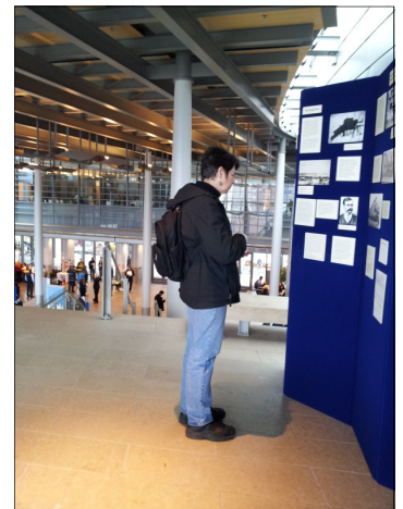
City Hall Open House, January 28, 2012

The Seattle Municipal Archives and the Office of the City Clerk participated in an open house at City Hall on Saturday, January 21, held by the Mayor and City Council. Citizens came to tour the offices of City Council and the Mayor and talk with departmental representatives from all over the City. Participating in this opportunity for civic engagement, the SMA staff talked with the public, many of whom enjoyed the historical exhibit, "Seattle's City Halls."