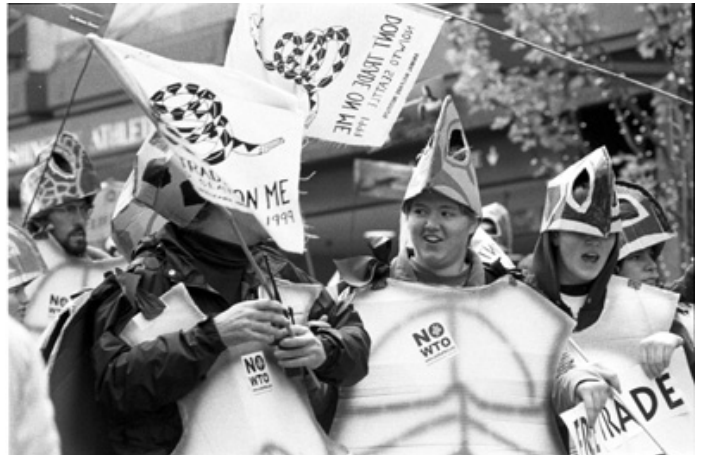
World Trade Organization Protest, December 6, 1999 Item 166267, Fleets and Facilities ImageBank Photographs, Record Series 0207-01, Seattle Municipal Archives.

Recently scanned WTO protest photos offer a new glimpse of this historic event. There has been an uptick in interest in these previously unprocessed photos. Seventy-five black and white negatives have been added to the Photo Index, including several shots of Seattle's Mounted Police Unit. These images capture the citizenry in action and display the emotion and determination of the Seattleites who turned out for the rallies. Search "World Trade Organization and 0207-01" in the Photo Index or click on the link above to view.