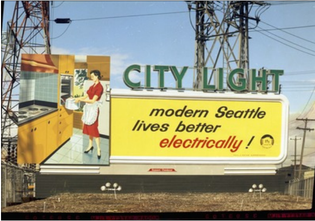
Seattle City Light billboard at 4 th and Spokane, 1968 Item 78730, City Light Photographic Negatives, Series 1204-01, Seattle Municipal Archives.

Among the hundreds of new images cataloged, scanned, and posted online is a set of Seattle City Light images from 1961 and 1968. Included are billboards promoting the use of electricity, employee events, and displays at conventions and other events.