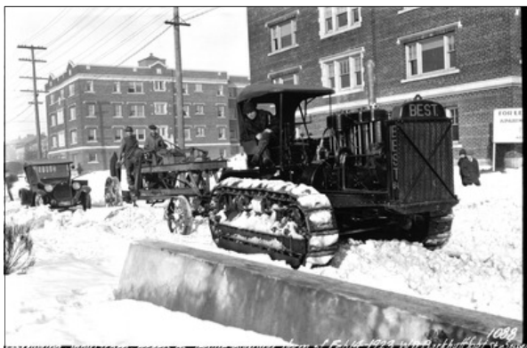
Removing snow on Seattle streets after February 14, 1943 snowstorm Item 12992, Seattle Municipal Archives

A photo documenting a snowplow at work in 1923 had no information attached identifying the location. After one commenter theorized that it may have been taken on First Hill or Capitol Hill, another recognized a building in the background and determined that the photo was taken on Highland Drive in Queen Anne.