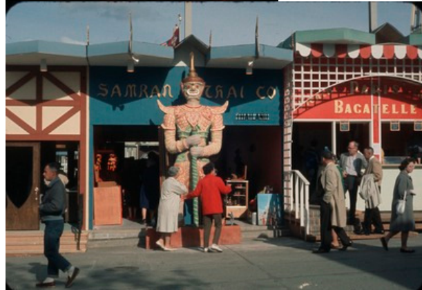
International exhibits at Century 21, April 1962 Item 77821