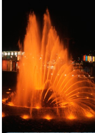
International Fountain at night, April 1962 Item 77820, Seattle Municipal Archives

Also new online are 59 images of the 1962 World's Fair, or Century 21, taken by citizen Jim Skinner in April 1962. In addition to general images of the Fair, images of the Ice Follies performance are included.