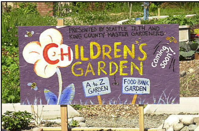
Bradner Gardens Park, Matching Fund site, May 24, 2000 Item 101954

Another set of records documents the variety of projects completed under the city's Neighborhood Matching Fund program. Project records include those for large grants awarded for