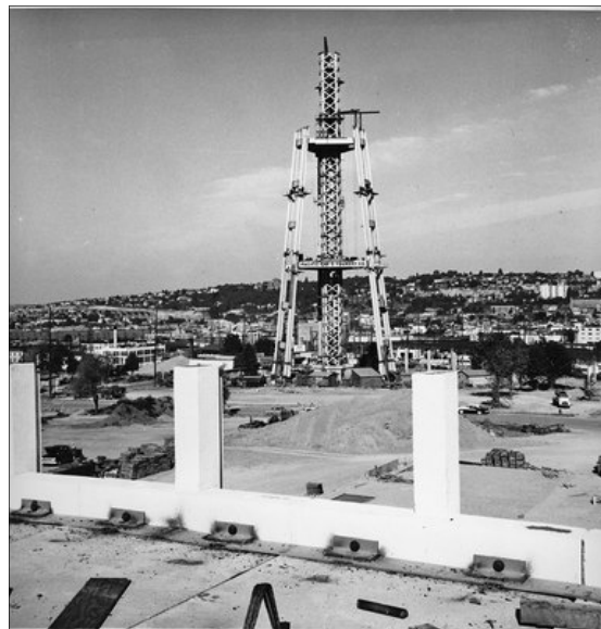
Space Needle construction, 1961